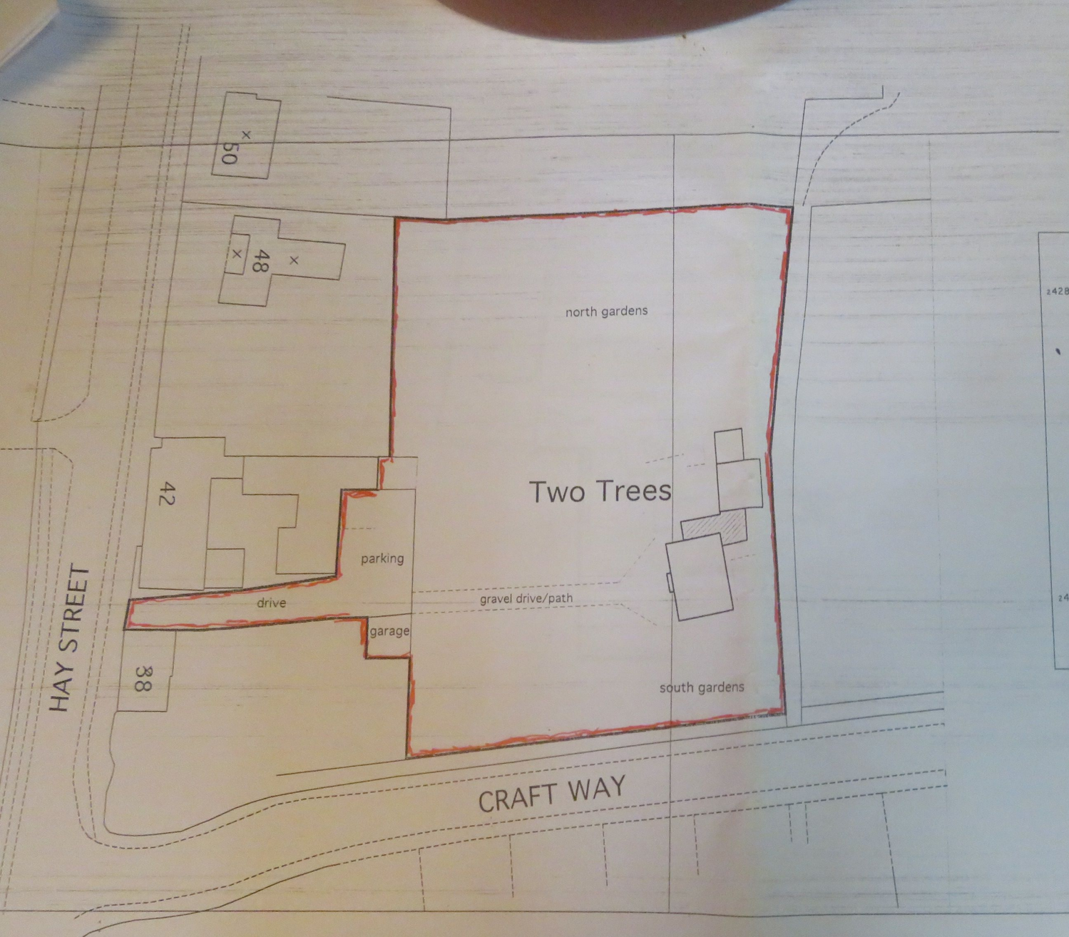
SITE PLAN 1: 500