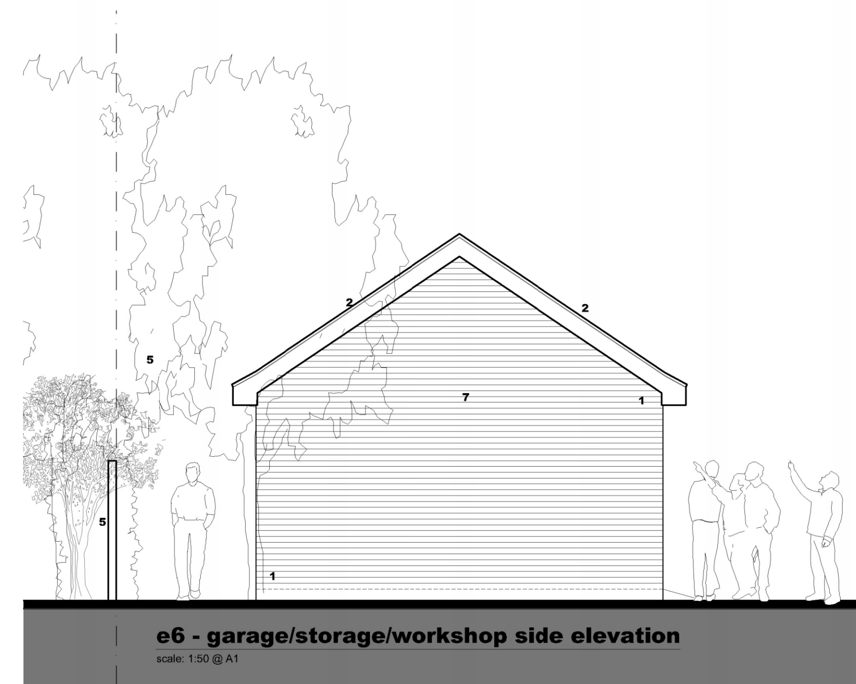
e6 - garage/storage/workshop side elevation