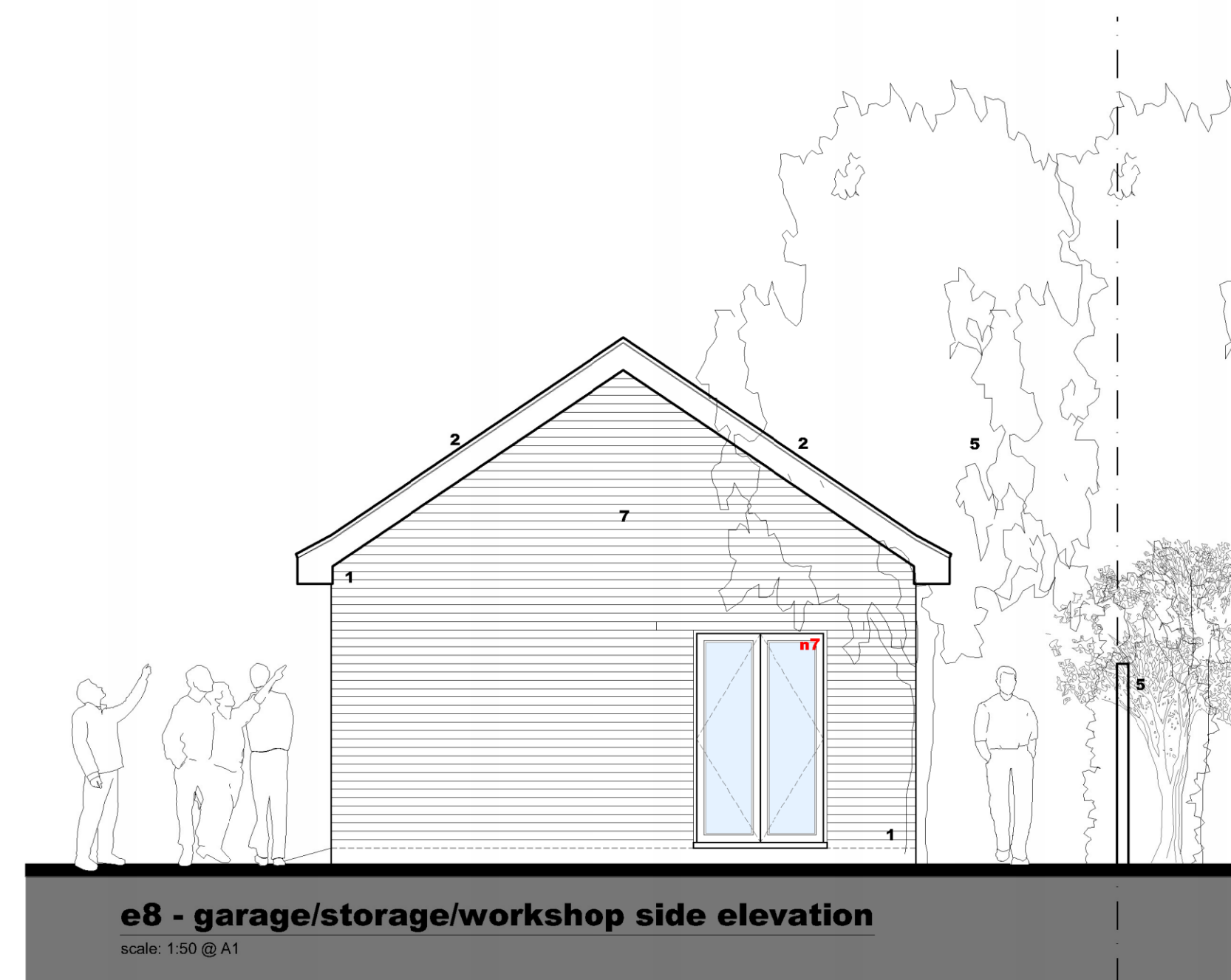
e8 - garage/storage/workshop side elevation