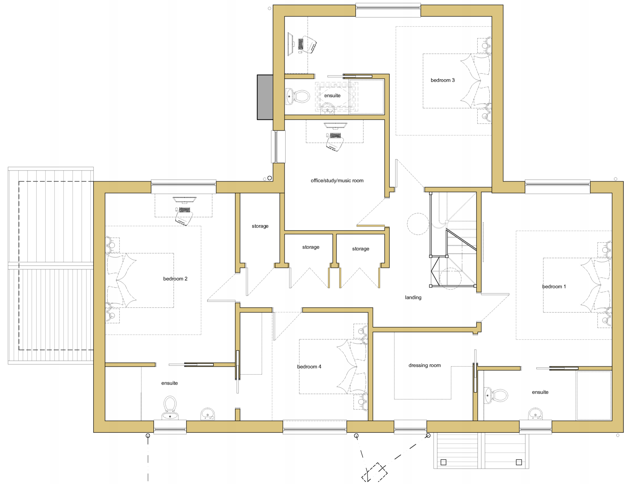
proposed first floor plan