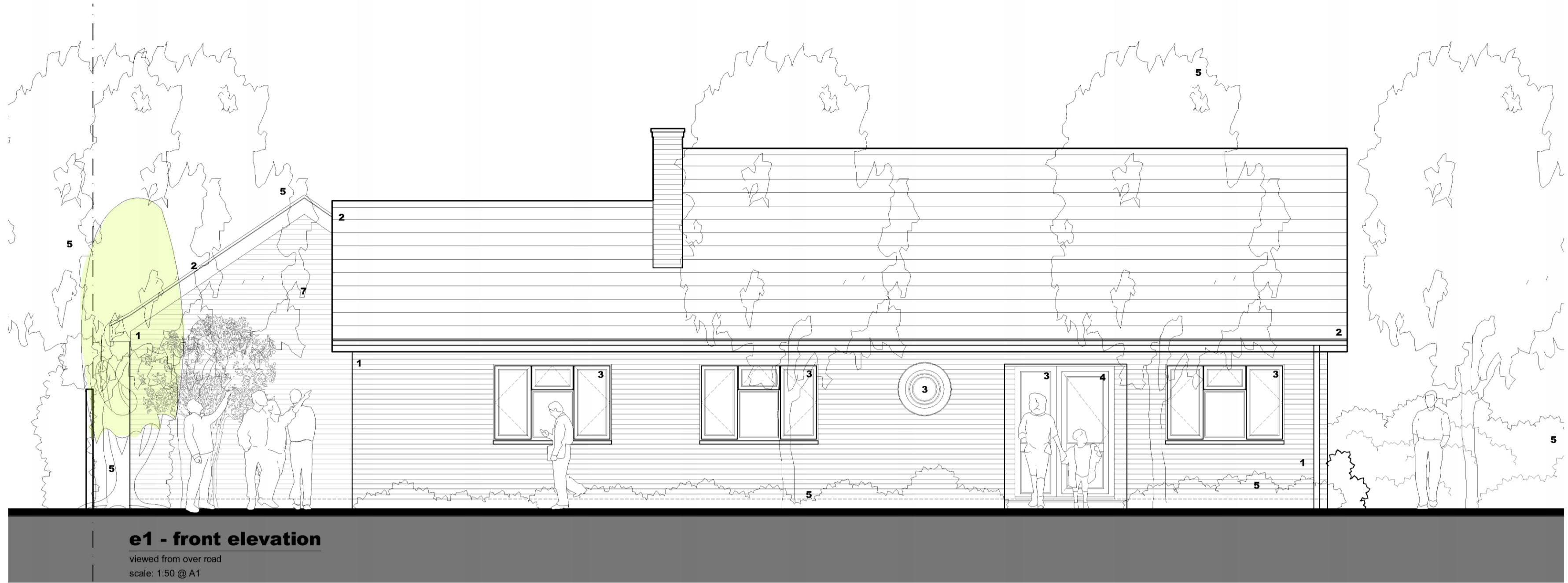
e1 - front elevation viewed from over road scale: 1:50 @ A1

general notes © this drawing and all information it contains is copyright of plan | it architecture + design ltd and must not be copied or reproduced in whole or in part or used without express approval of the authors. this drawing to be read in conjunction with other drawings and specification produced by plan | it architecture + design ltd and other members of the design team. all dimensions are in millimeters unless otherwise stated, and to be checked on site prior to commencement of any works, do not scale this drawing, do not place orders without site dimension checks for materials, any discrepancies in dimensions are to be reported to plan | it architecture + design ltd. all information subject to being checked by builder when works start on site rev description date