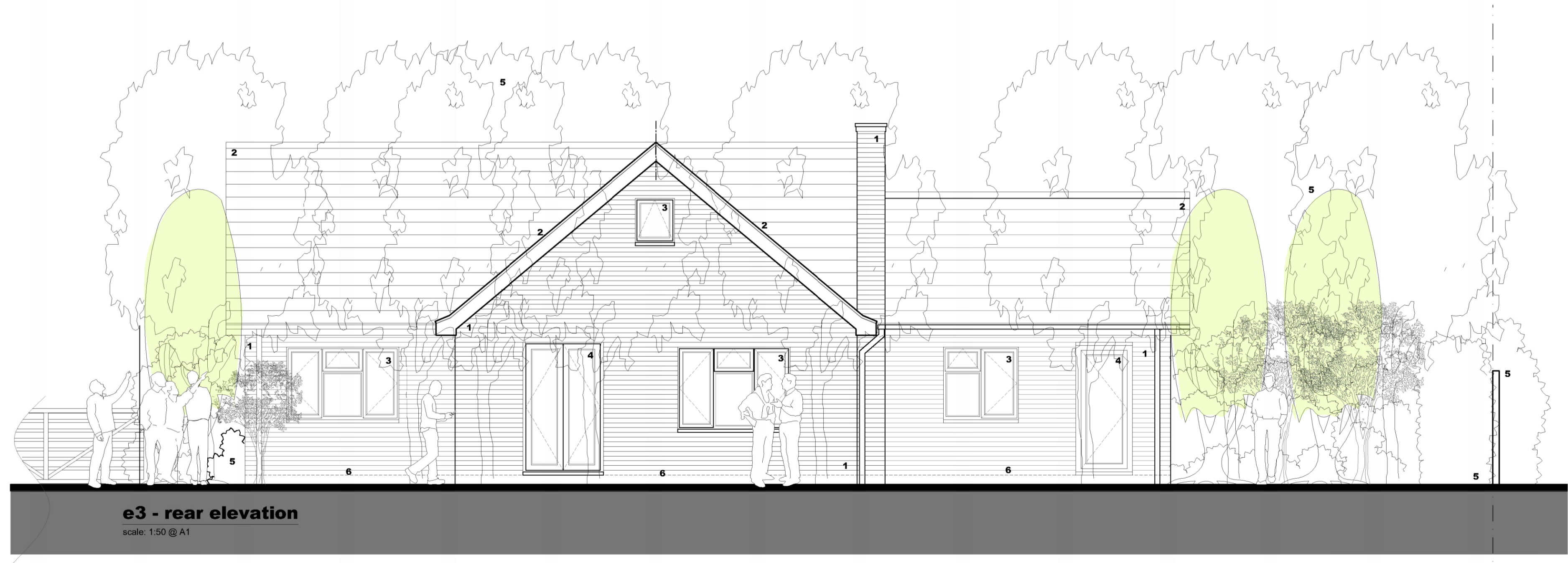
e3 - rear elevation scale: 1:50 @ A1