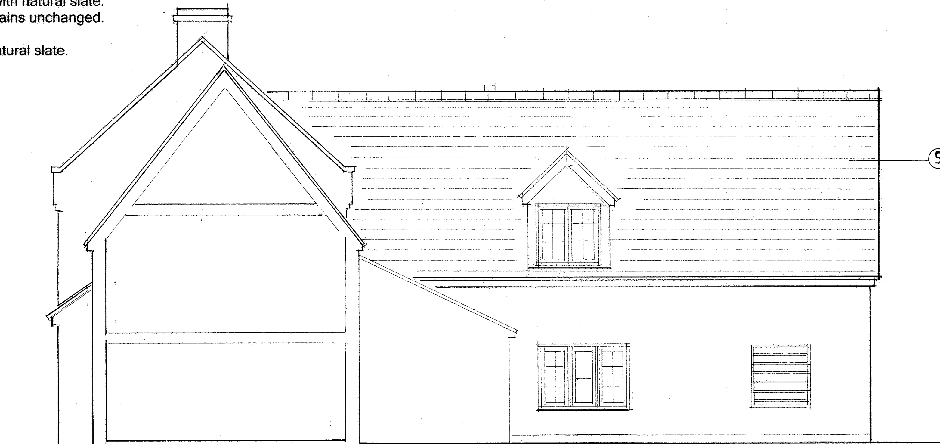
Elevation Facing South West. 1 : 50.