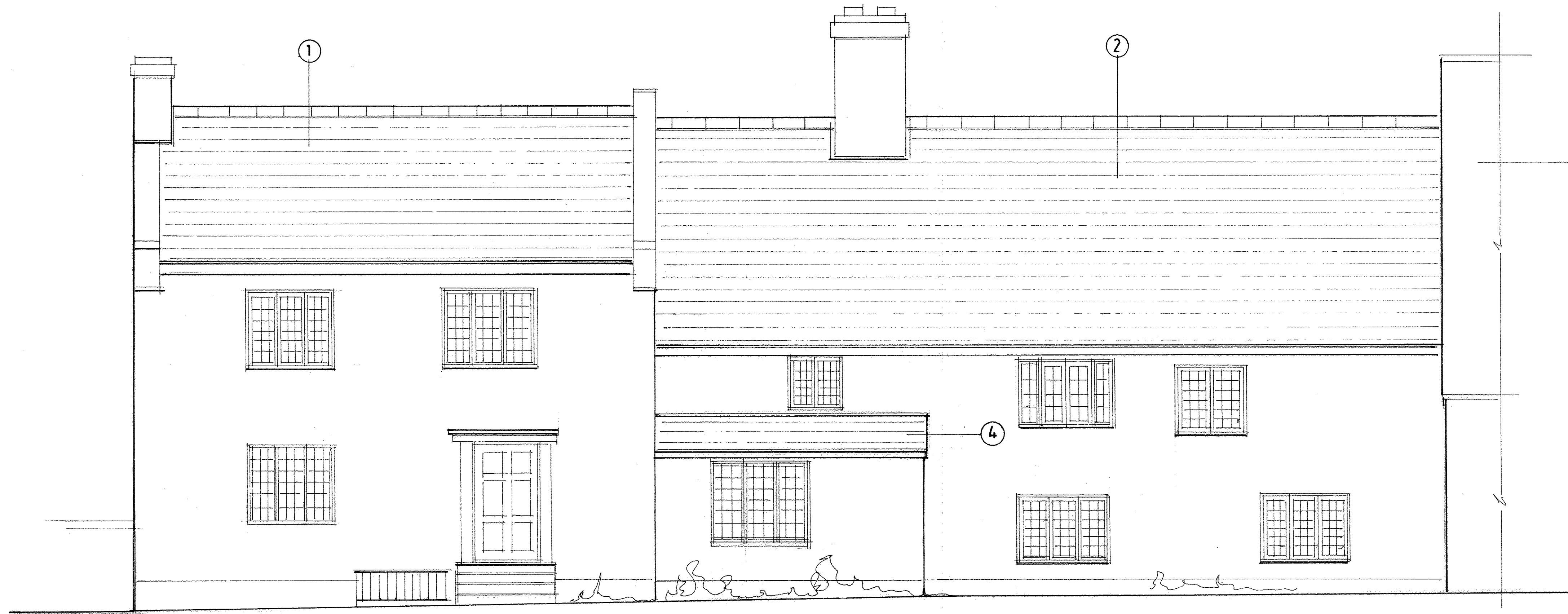
Elevation Facing North West. 1 : 50.