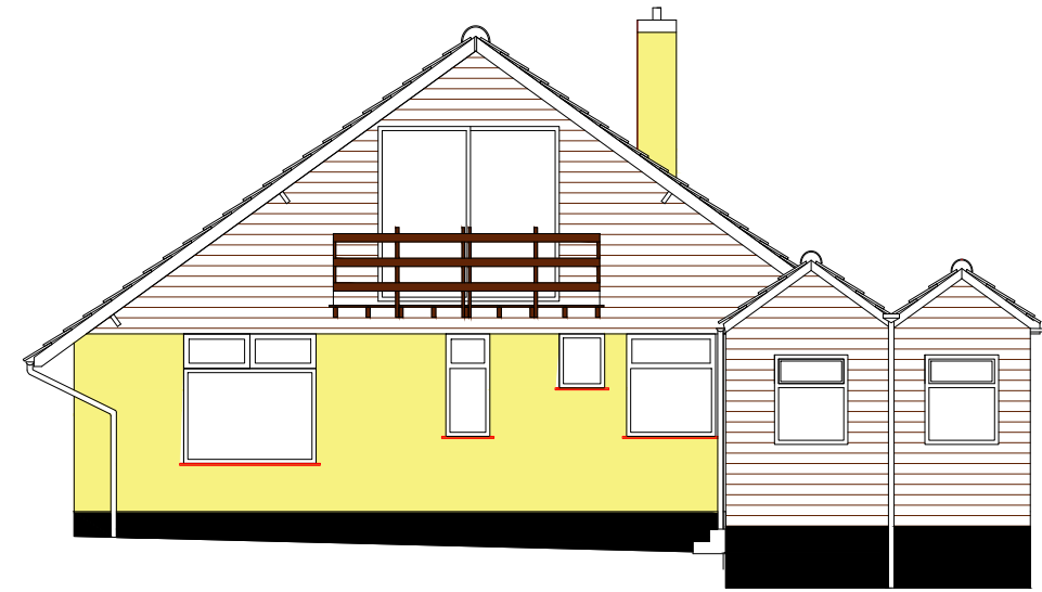
Rear Elevation - Existing