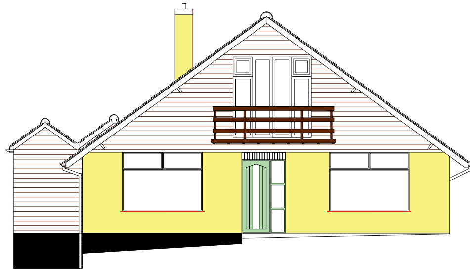
Front Elevation - Existing