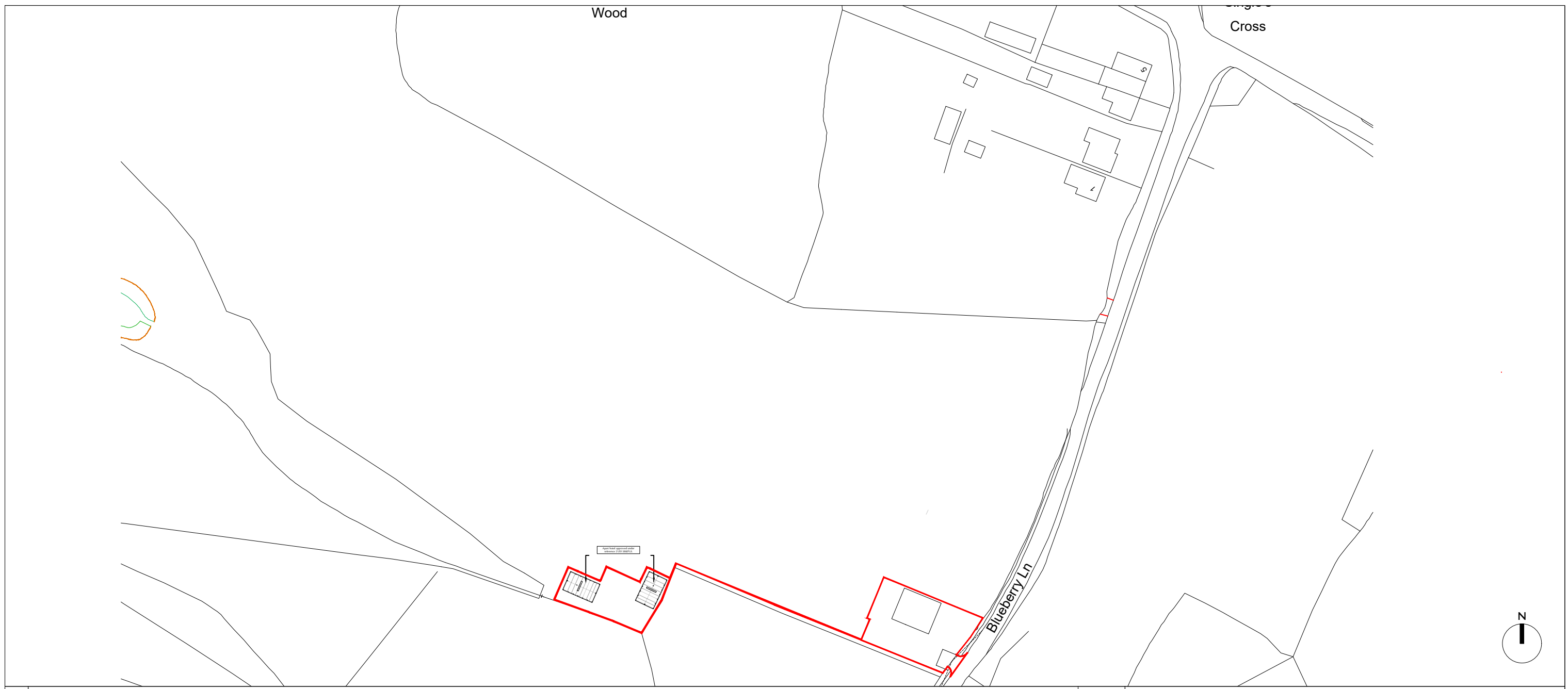
20 1250 Proposed Site Plan