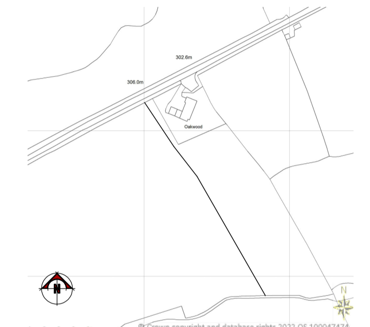
LOCATION PLAN 1 / 2500