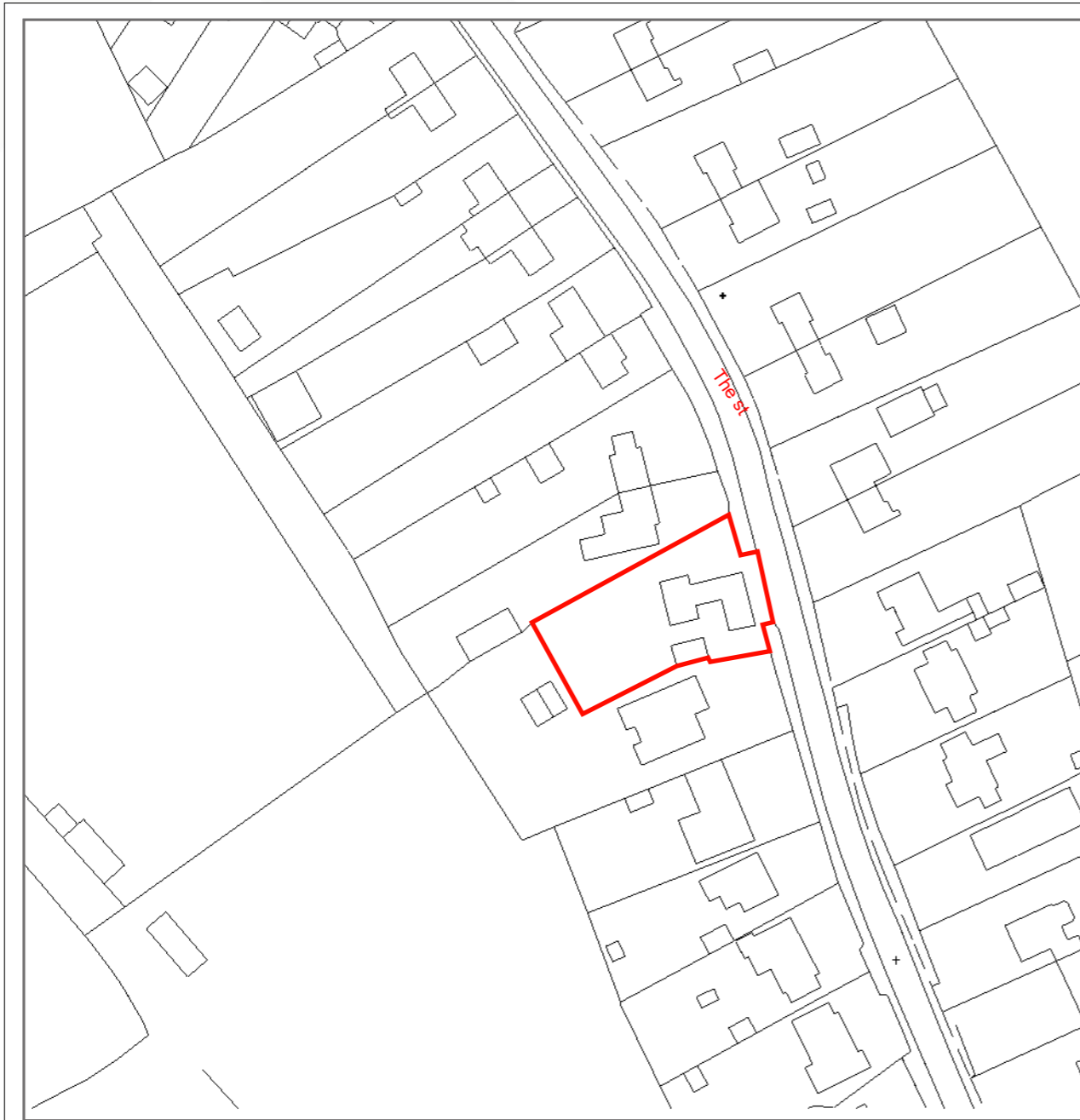
Existing Location Plan (1:1250)