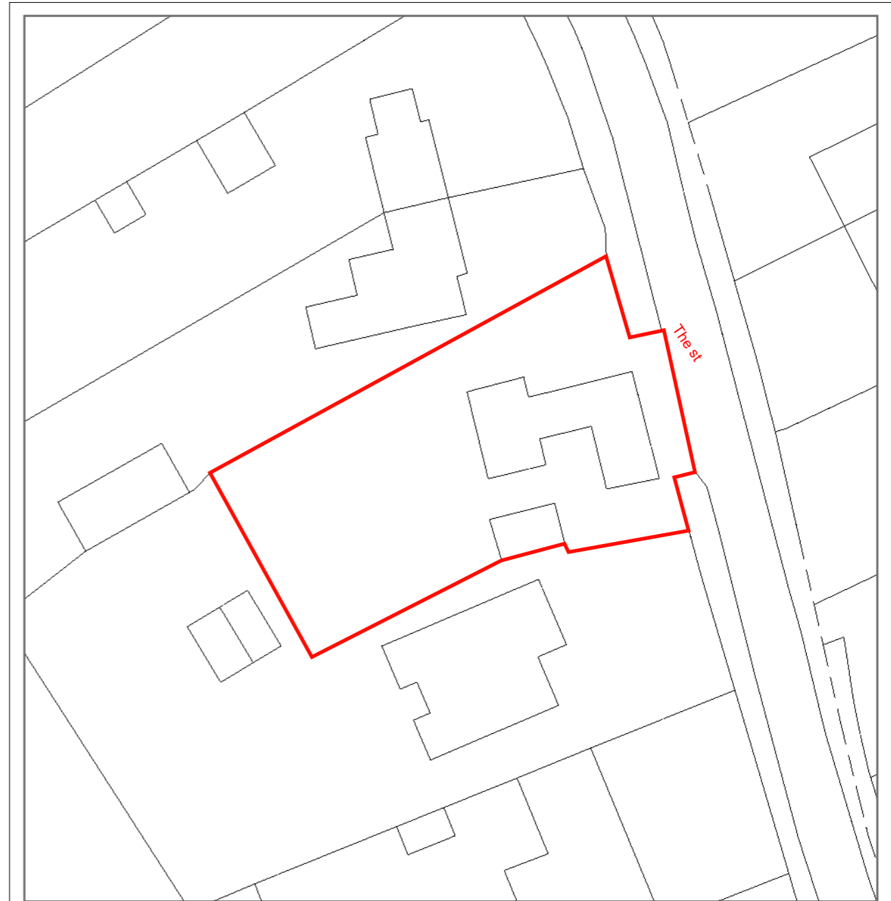
Existing Block Plan (1:500)