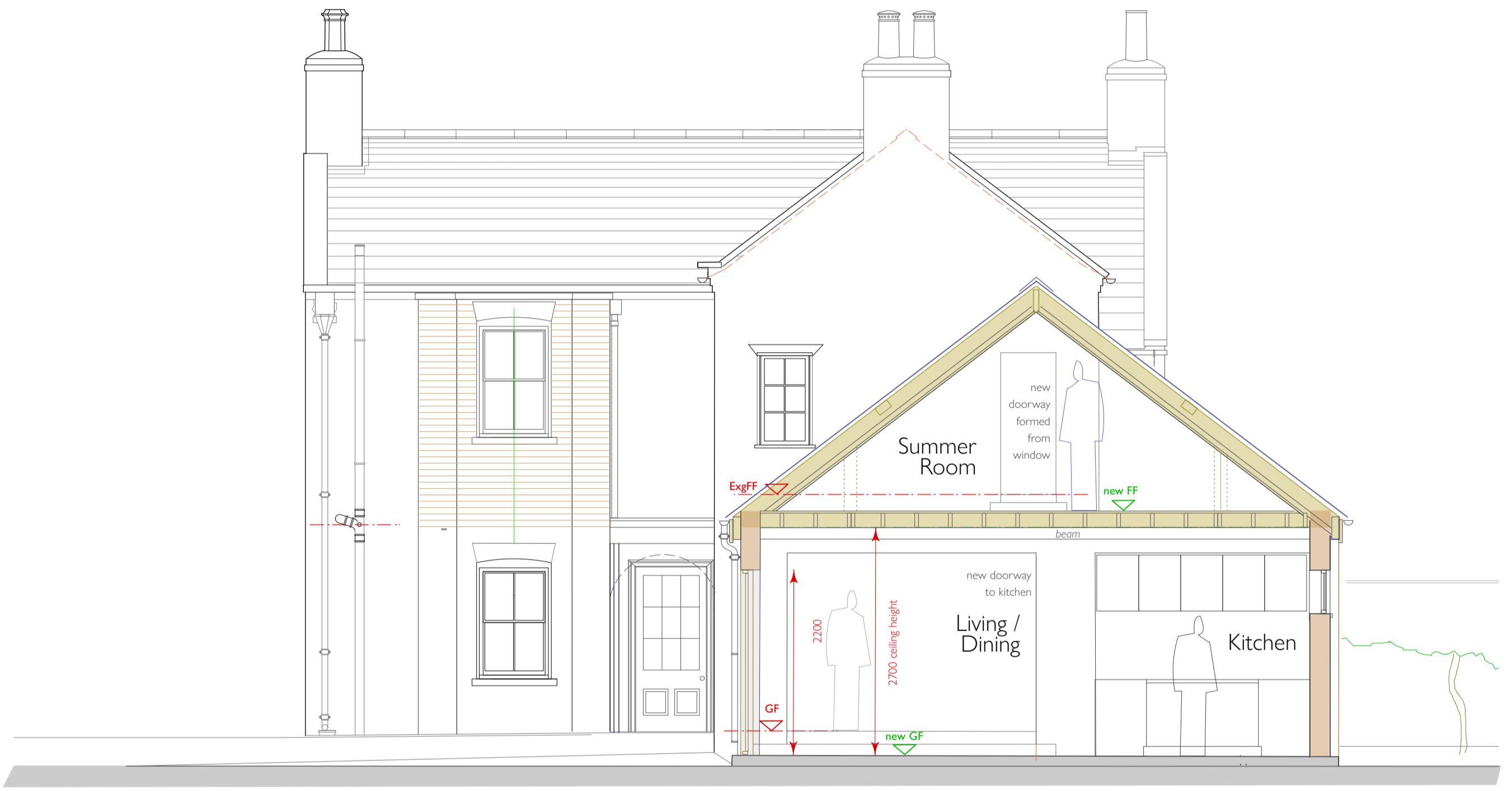
Section through Extension