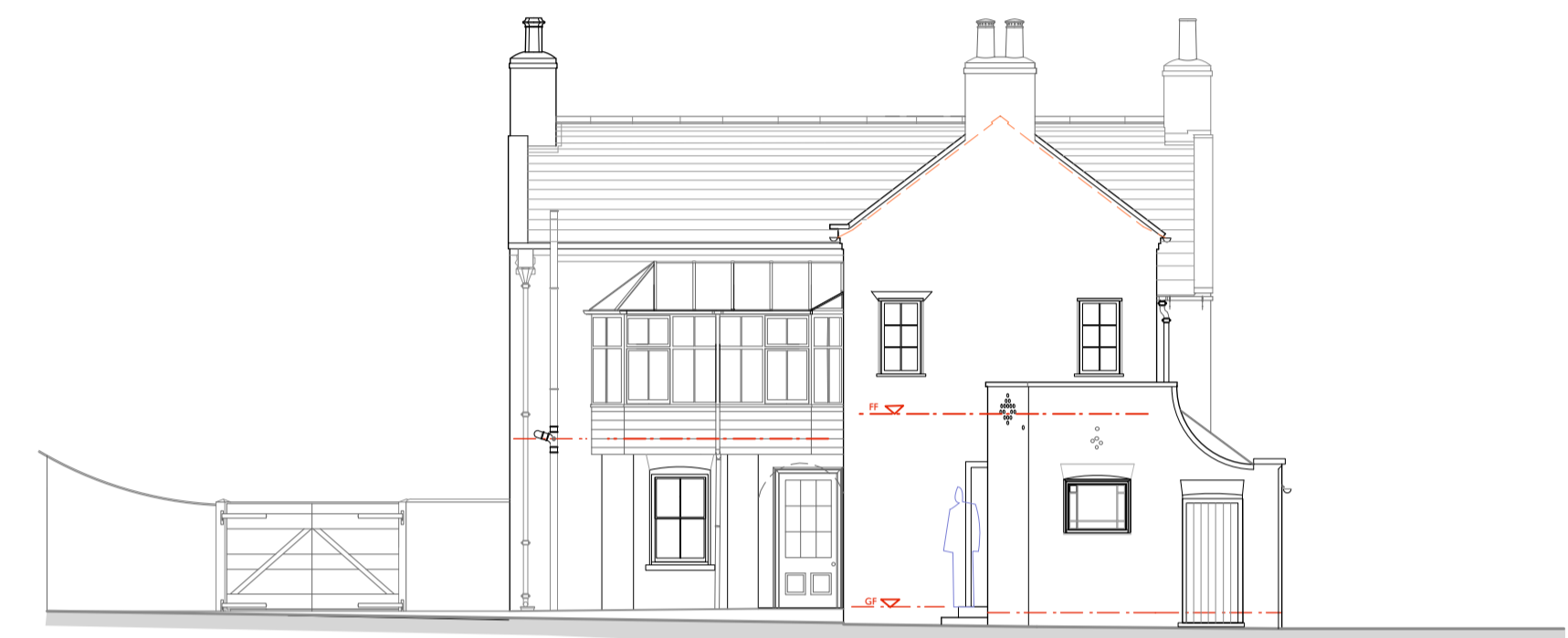
East (rear) Elevation