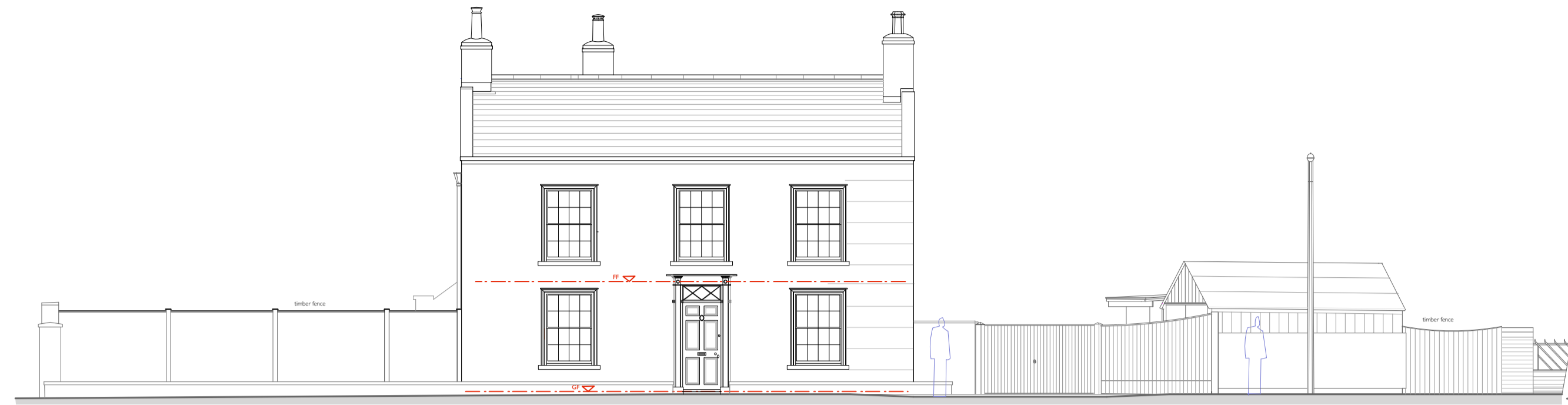
West (front) Elevation