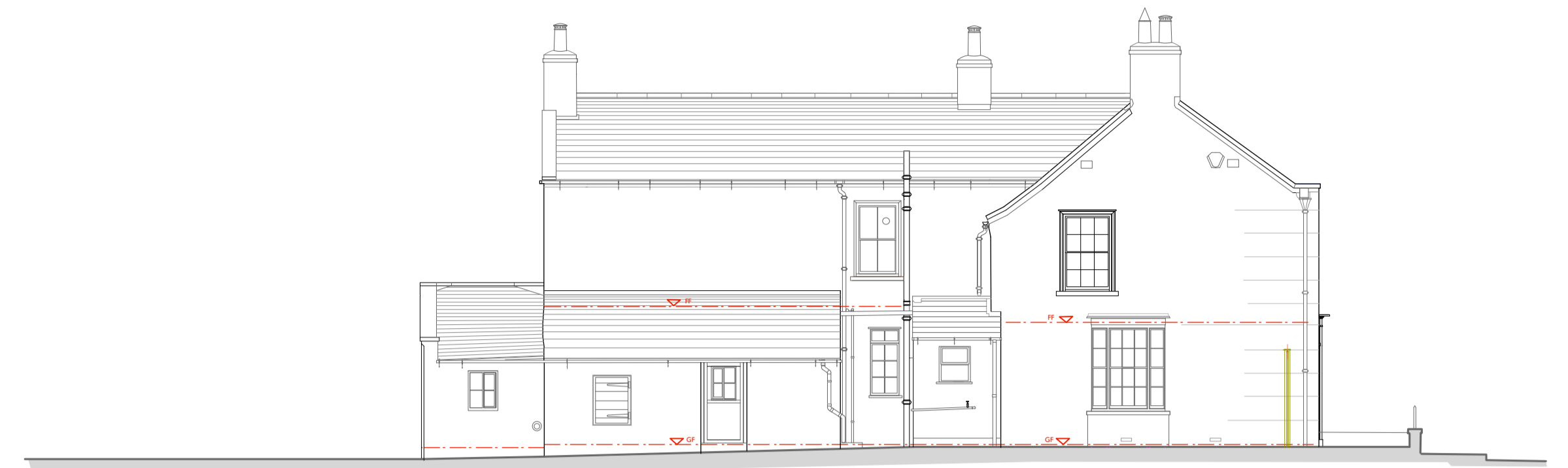
North (side) Elevation