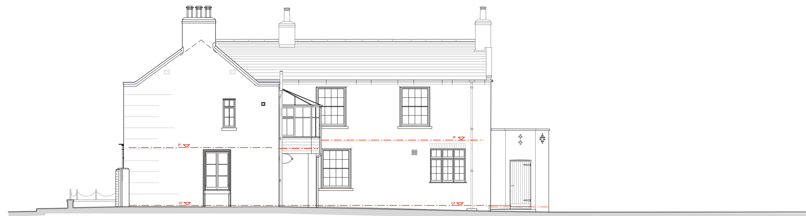
South (side) Elevation