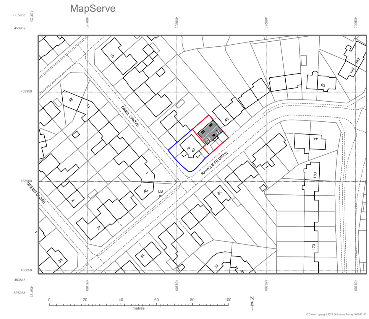
1 PROPOSED LOCATION PLAN A1 1:1250 PLAN