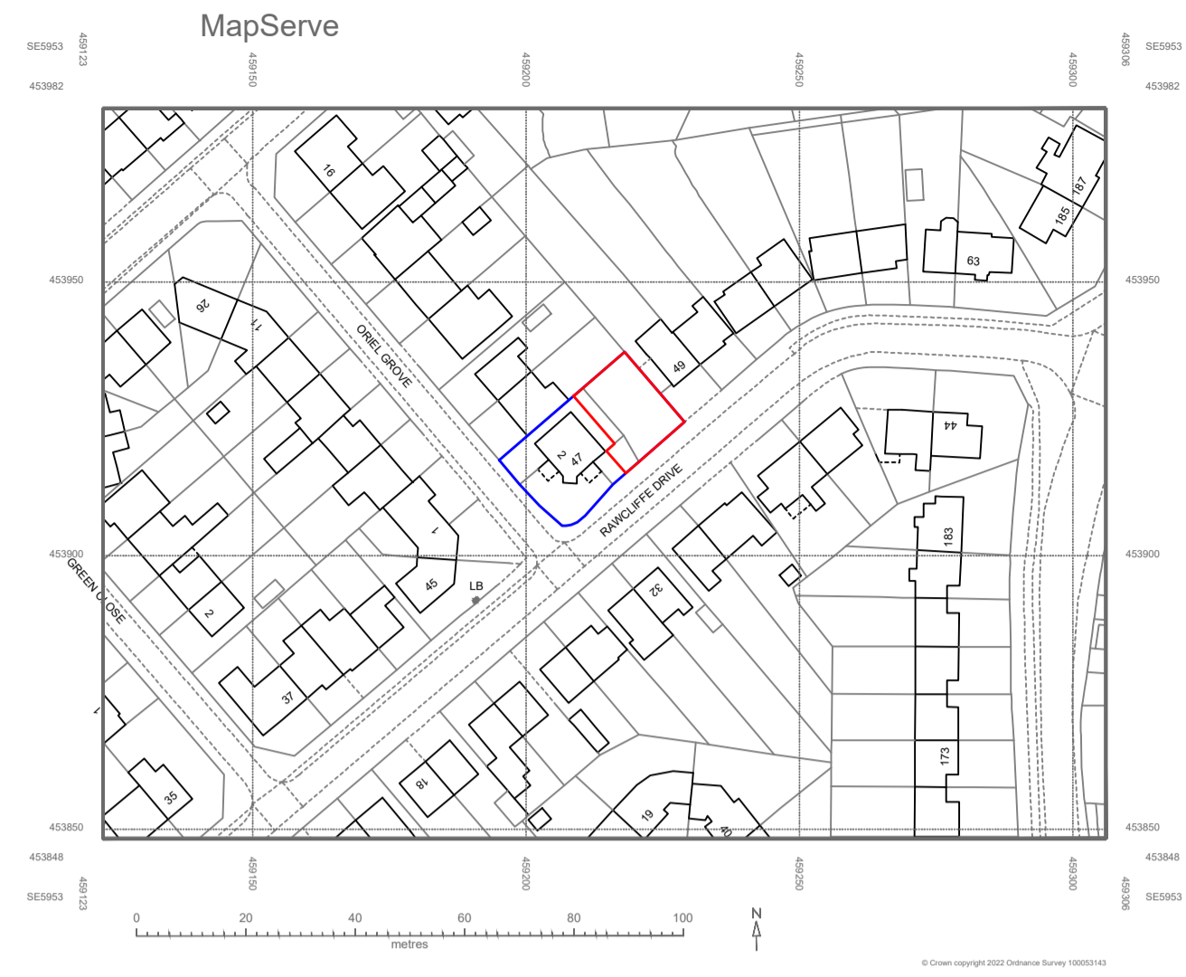
1 EXISTING LOCATION PLAN A1 1:1250 PLAN