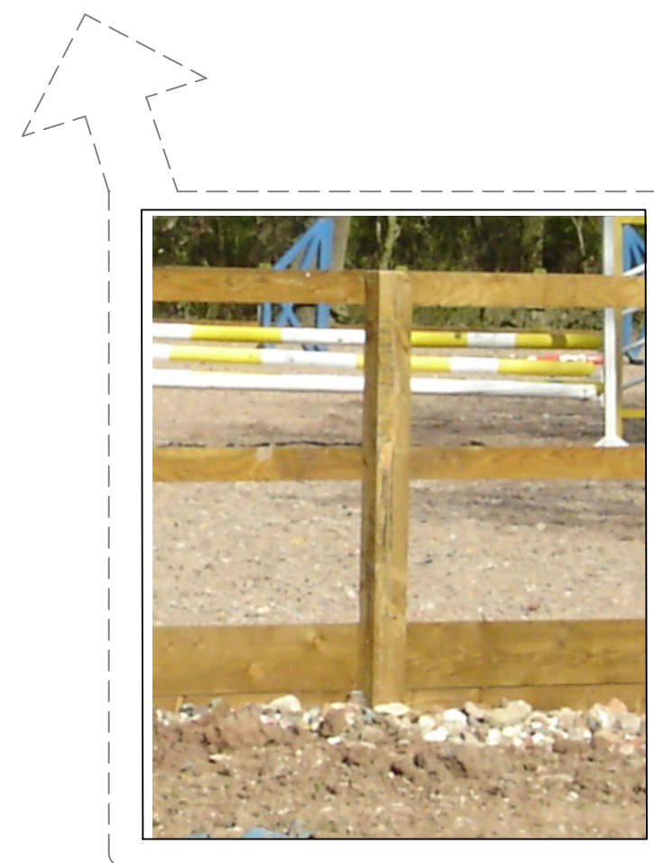
Proposed Perimeter Fence