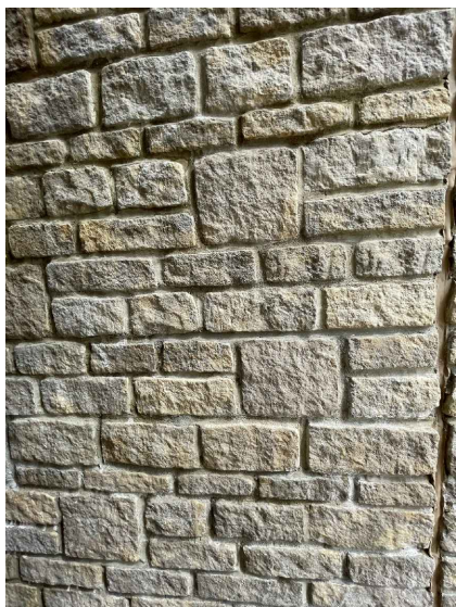
Photograph of walling used on adjacent development