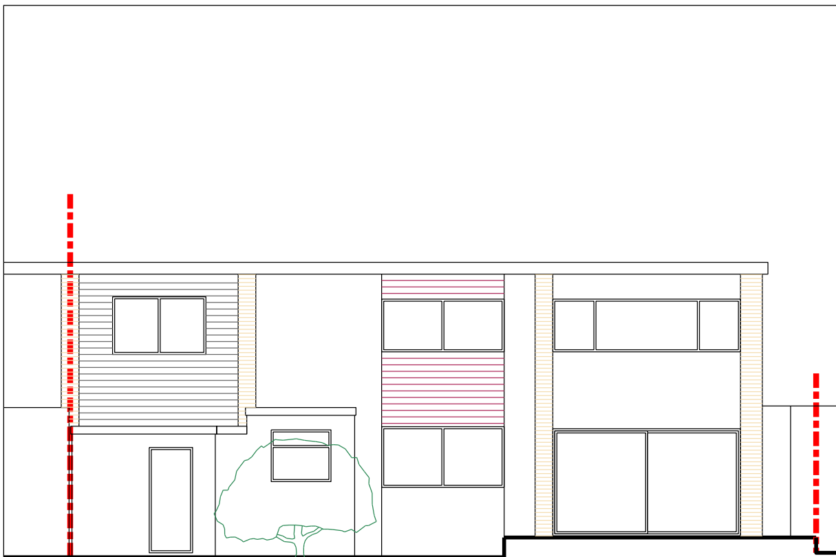
SE (rear) elevation