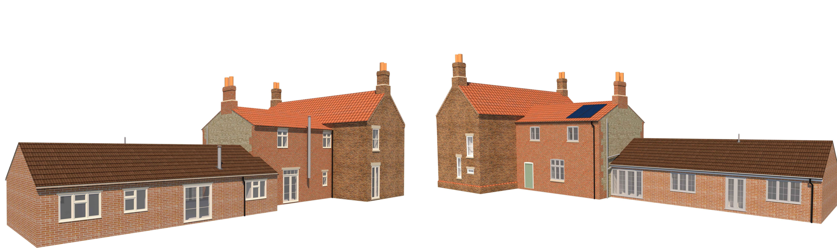
Existing Elevations (scale 1:100)