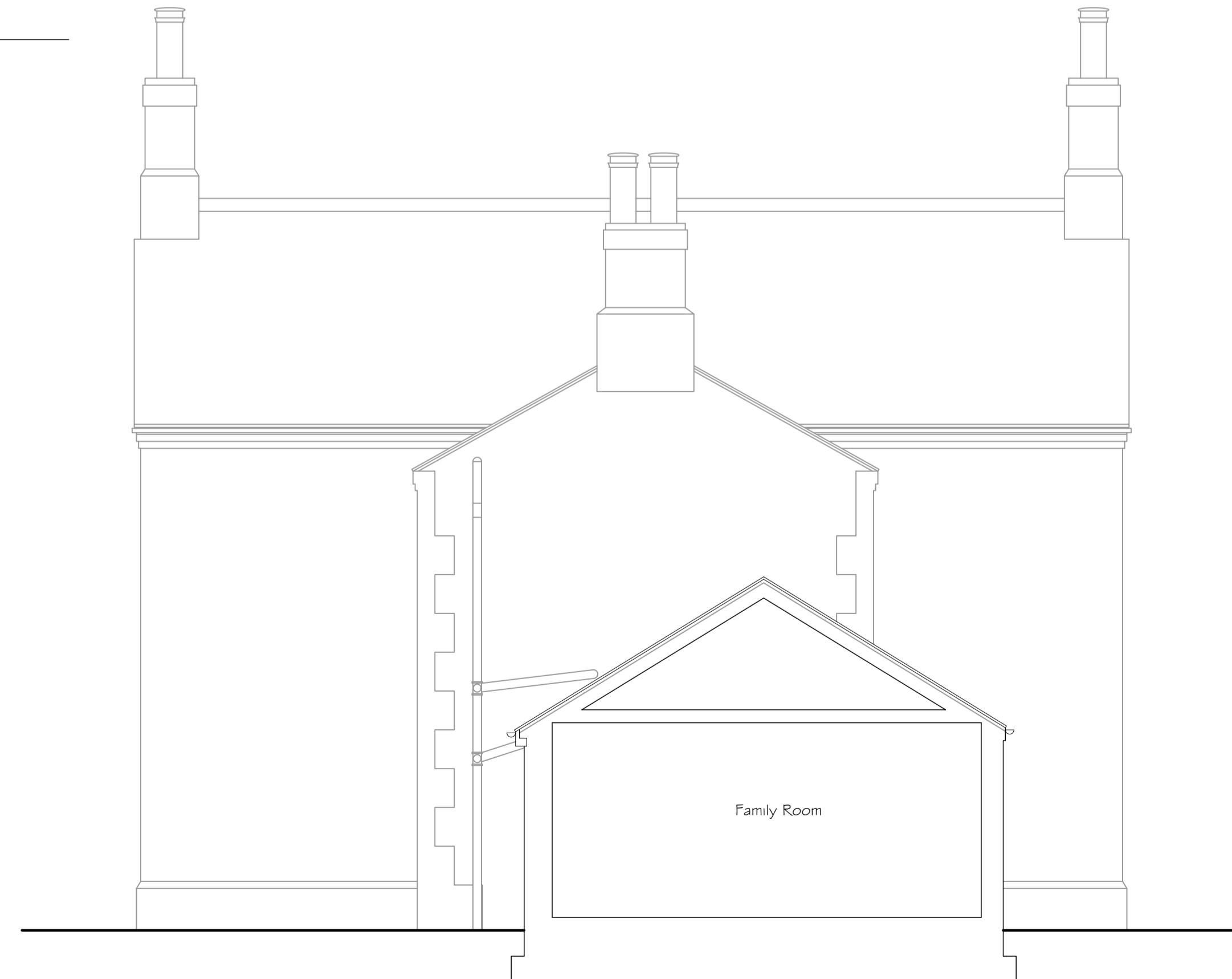
Part Section 1-1 Existing Section (scale 1:50)