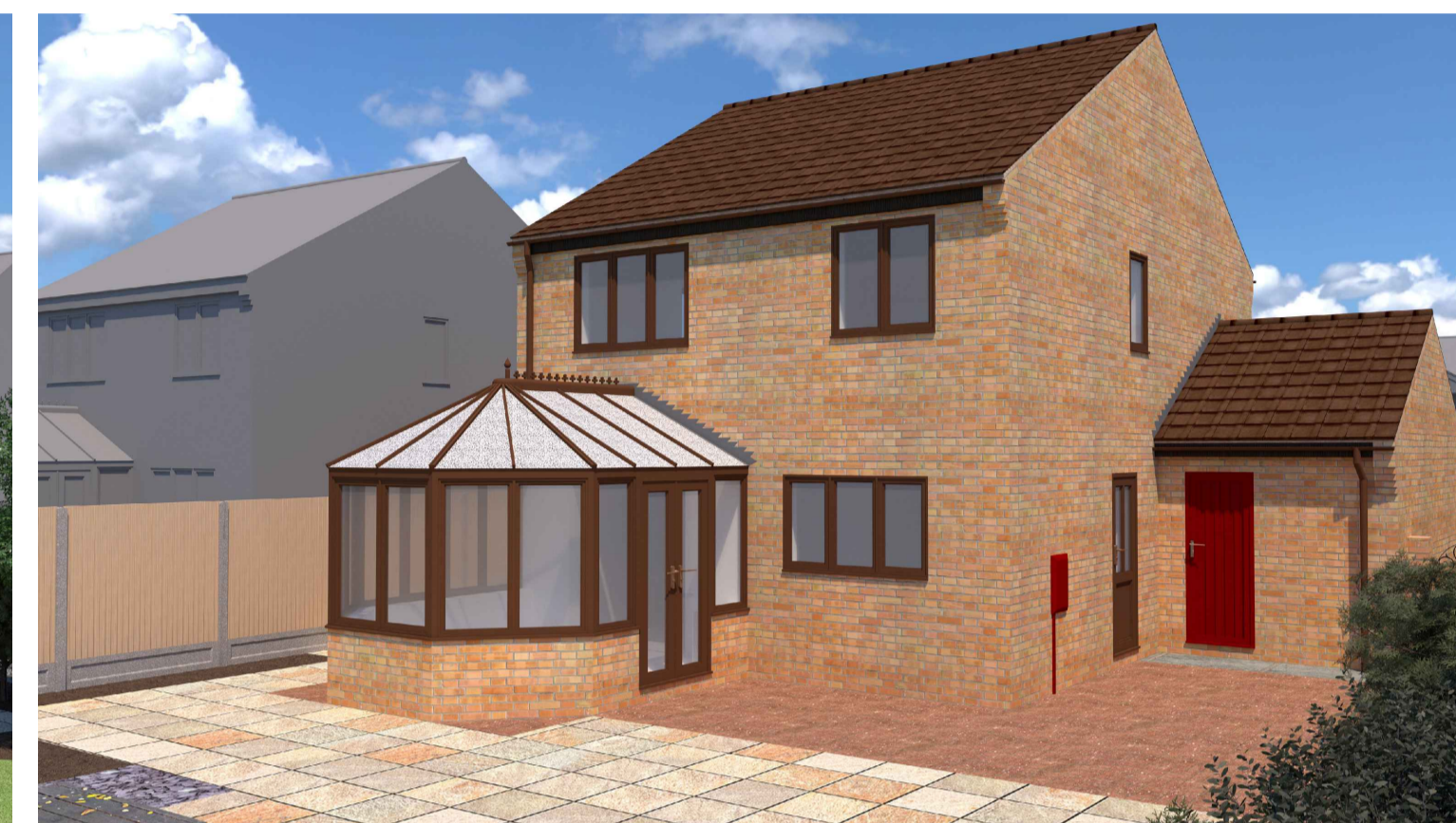
Existing Visuals (n.t.s)