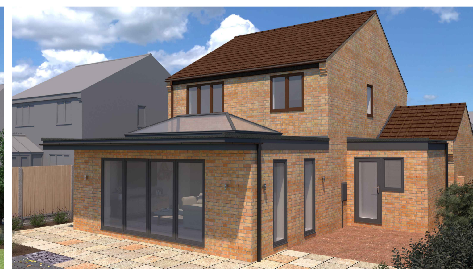
Proposed Visuals (n.t.s)