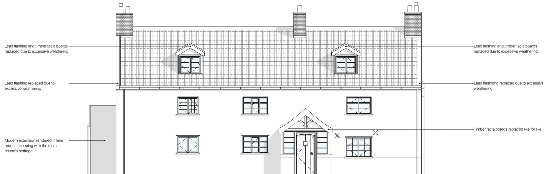
Proposed - Elevation - NW 1:100