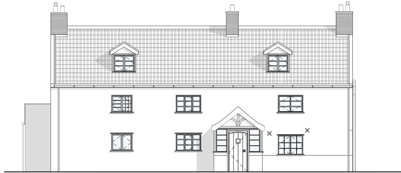
Existing - Elevation - NW 1:100

Keyplan Do not scale dimensions. Dimensions govern. All dimensions are in millimetres unless noted otherwise. Pitbow & Partners shall be notified in writing of any discrepancies.