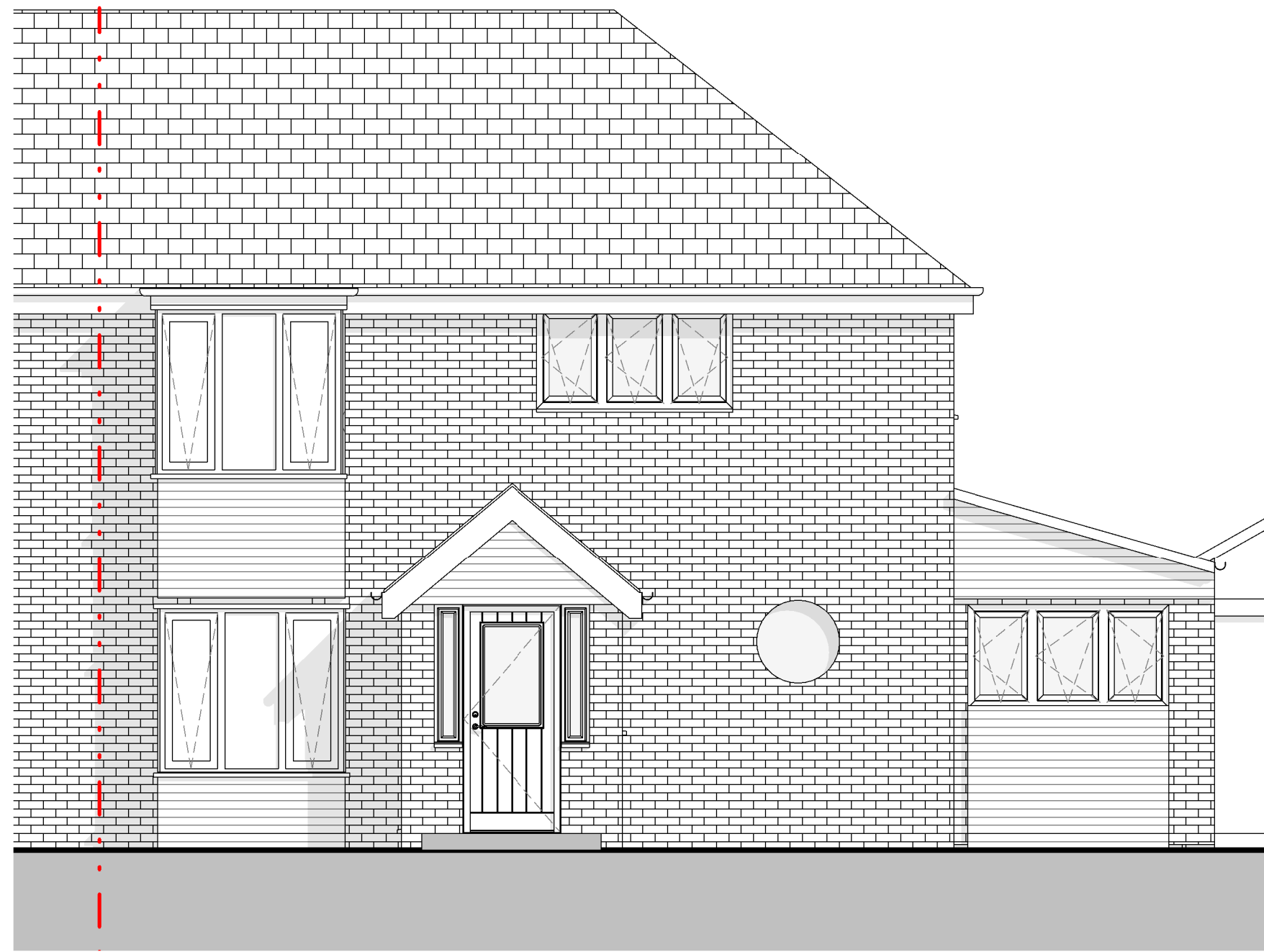
0.1 Existing Front Elevation 1:50