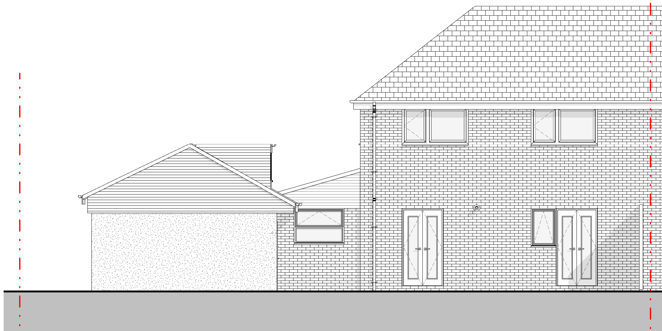
0.2 Existing Rear Elevation 1:50