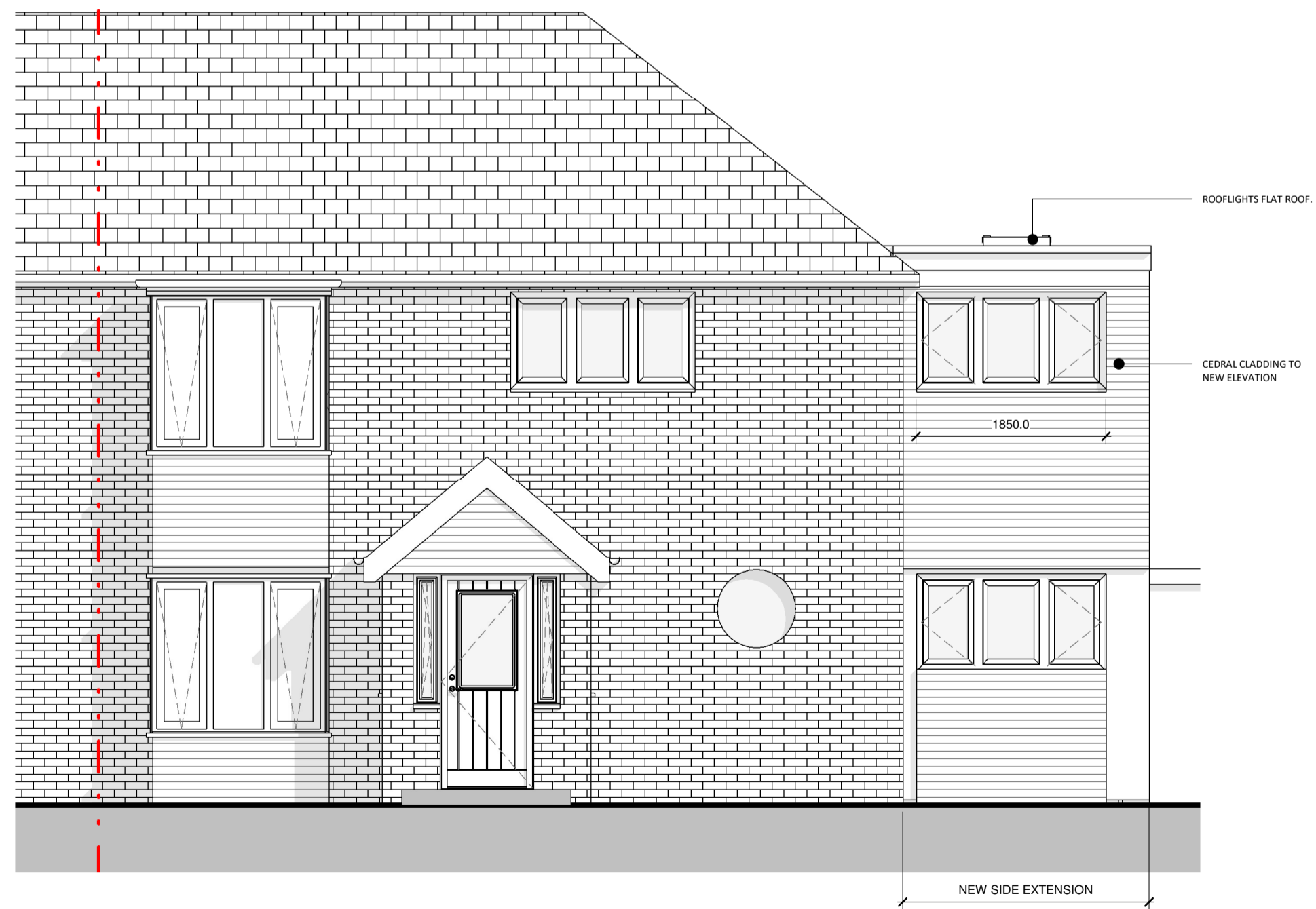
0.3 Proposed Front Elevation