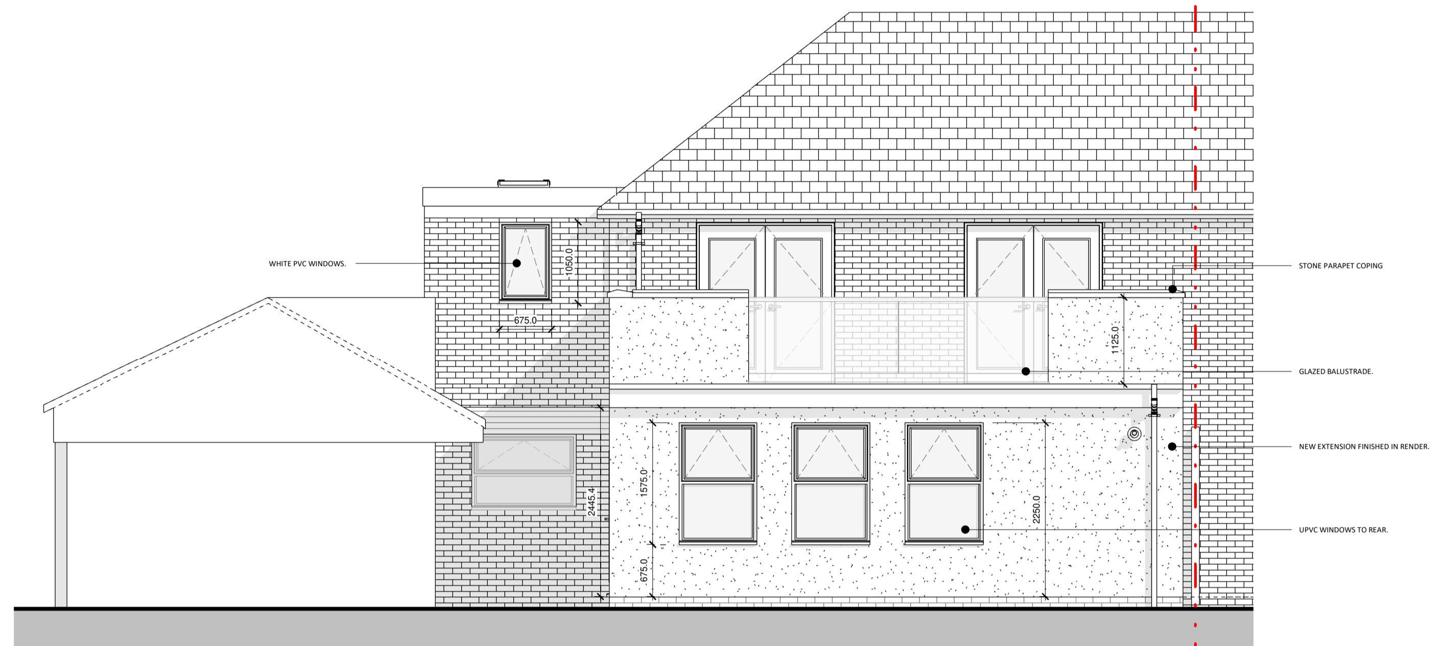
0.2 Proposed Rear Elevation