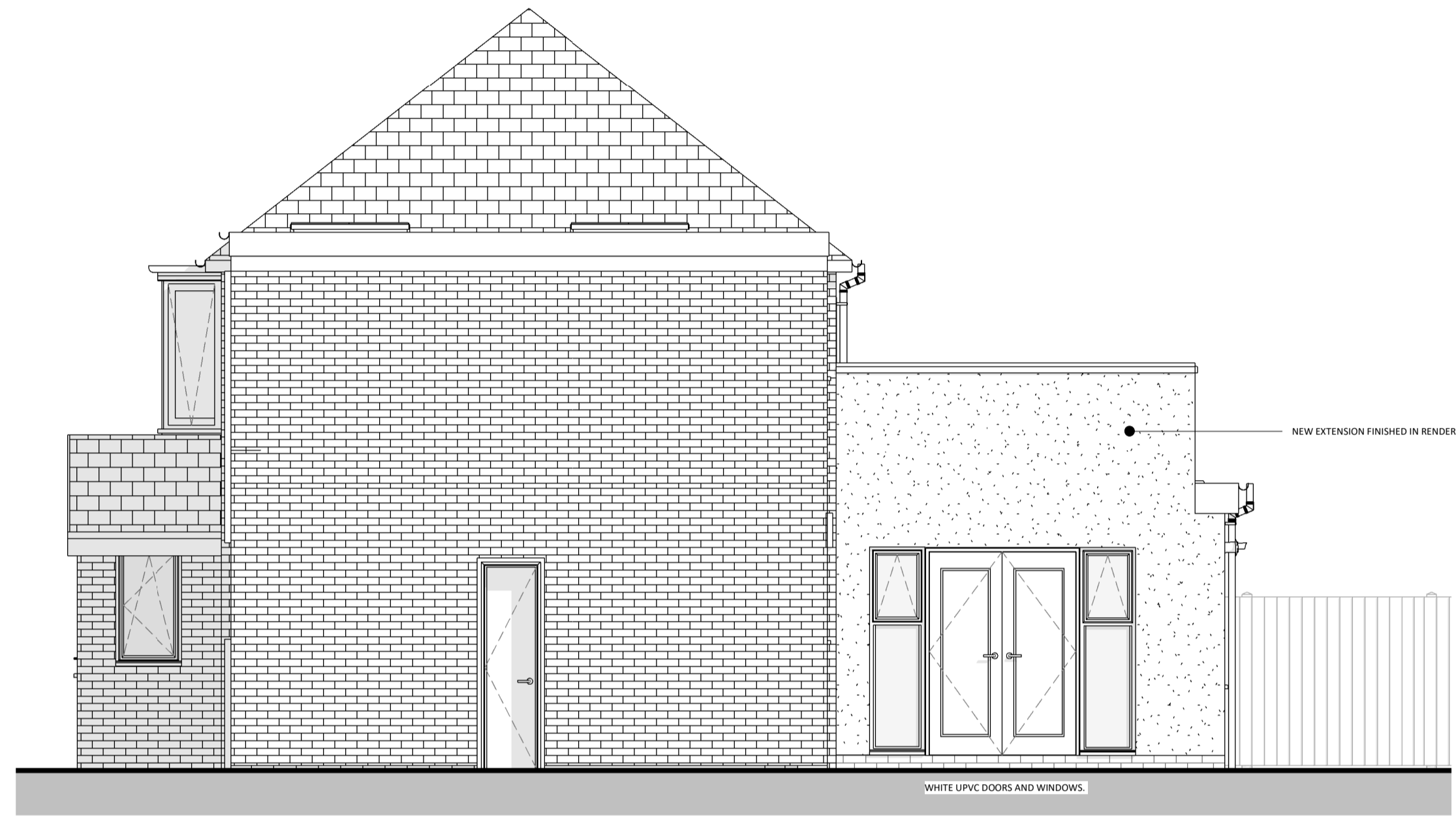
0.1 Proposed Side Elevation