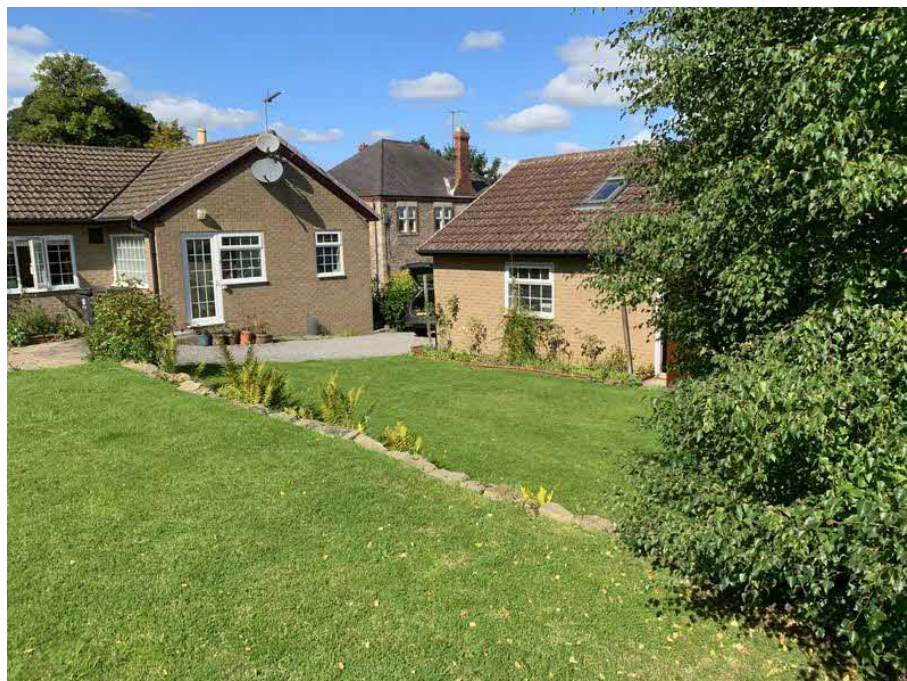
2. External Elevations and Spaces