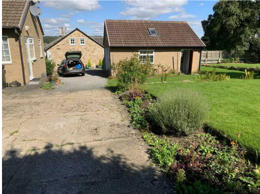
1. External Elevations and Spaces