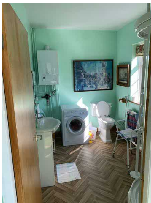
12. Utility Room