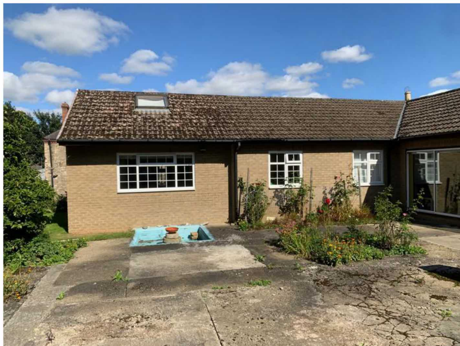
5. External Elevations and Spaces