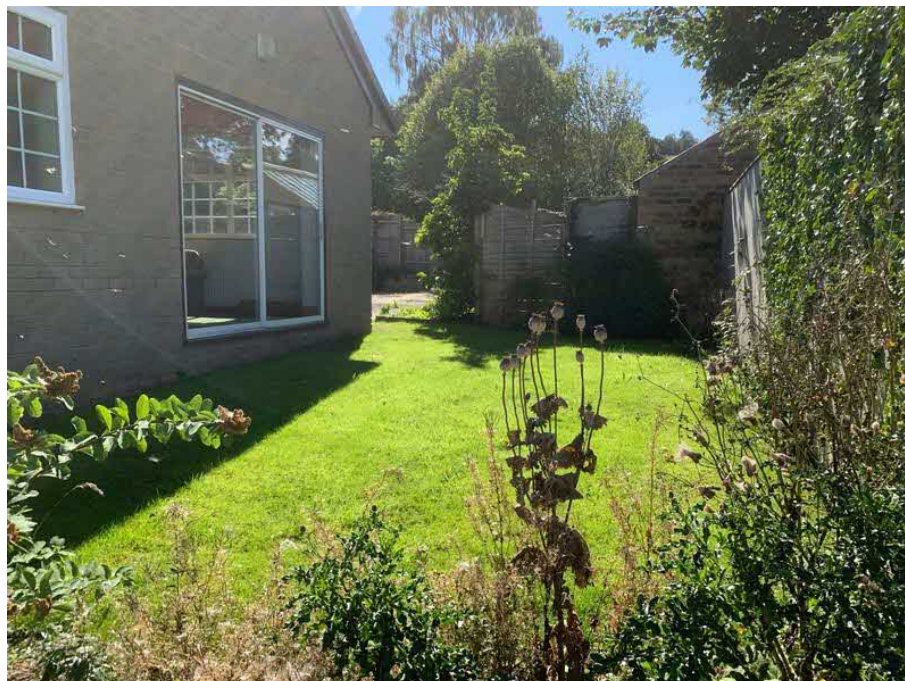
7. External Elevations and Spaces