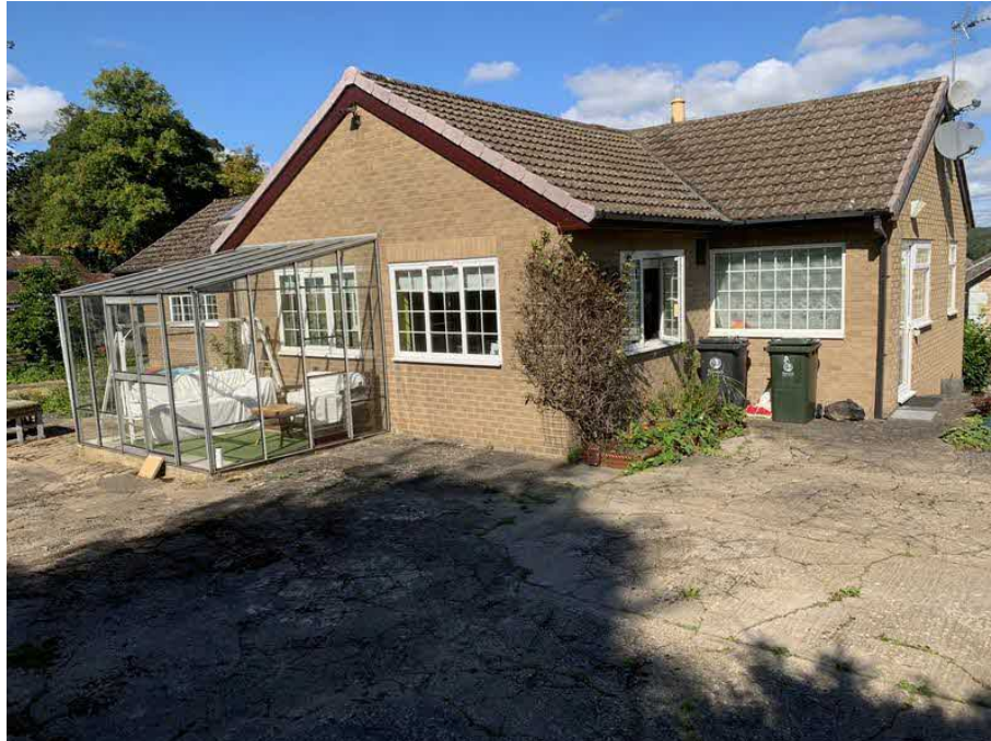
3. External Elevations and Spaces