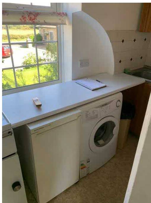
26. Small Kitchen