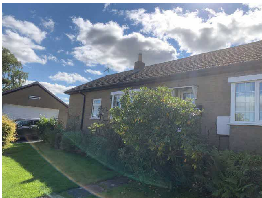
8. External Elevations and Spaces