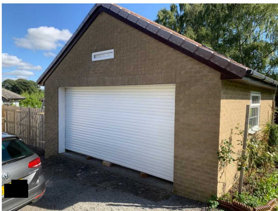
10. External Elevations and Spaces