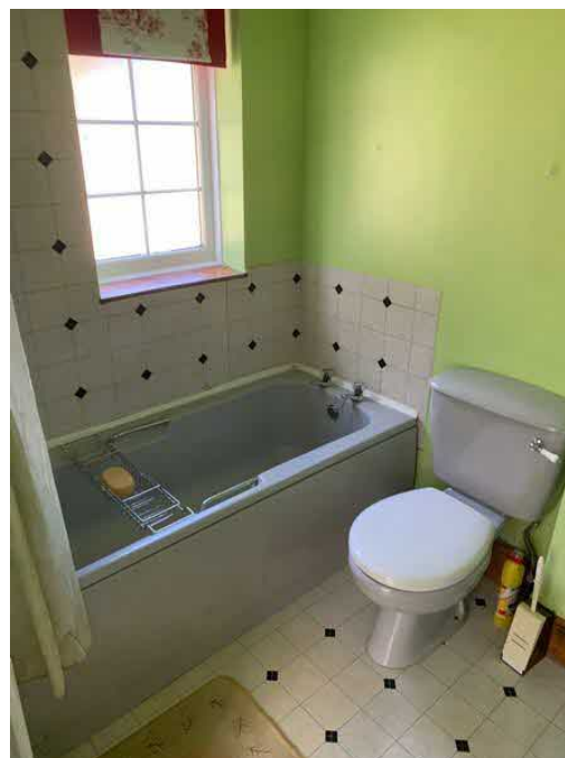
24. En-suite Bathroom