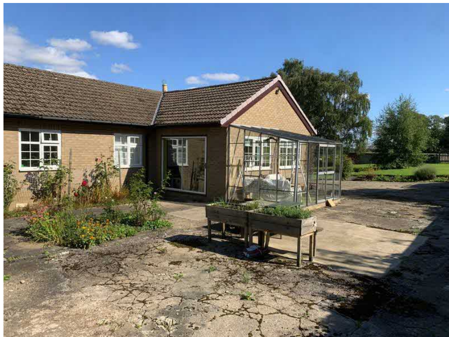
4. External Elevations and Spaces