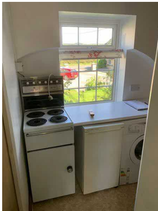
25. Small Kitchen