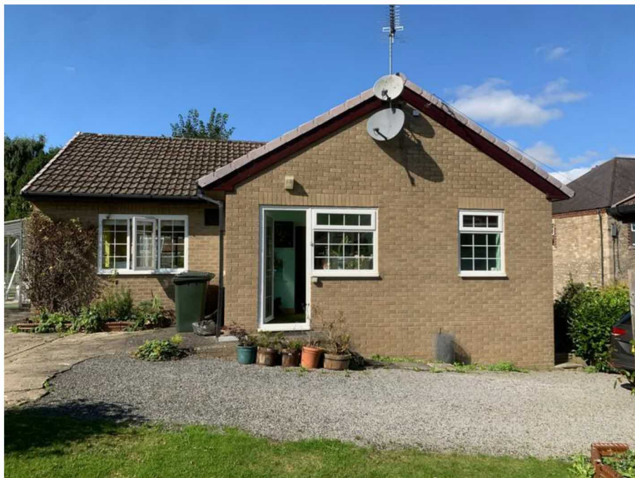
9. External Elevations and Spaces