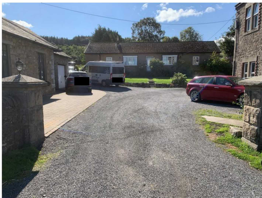
6. External Elevations and Spaces