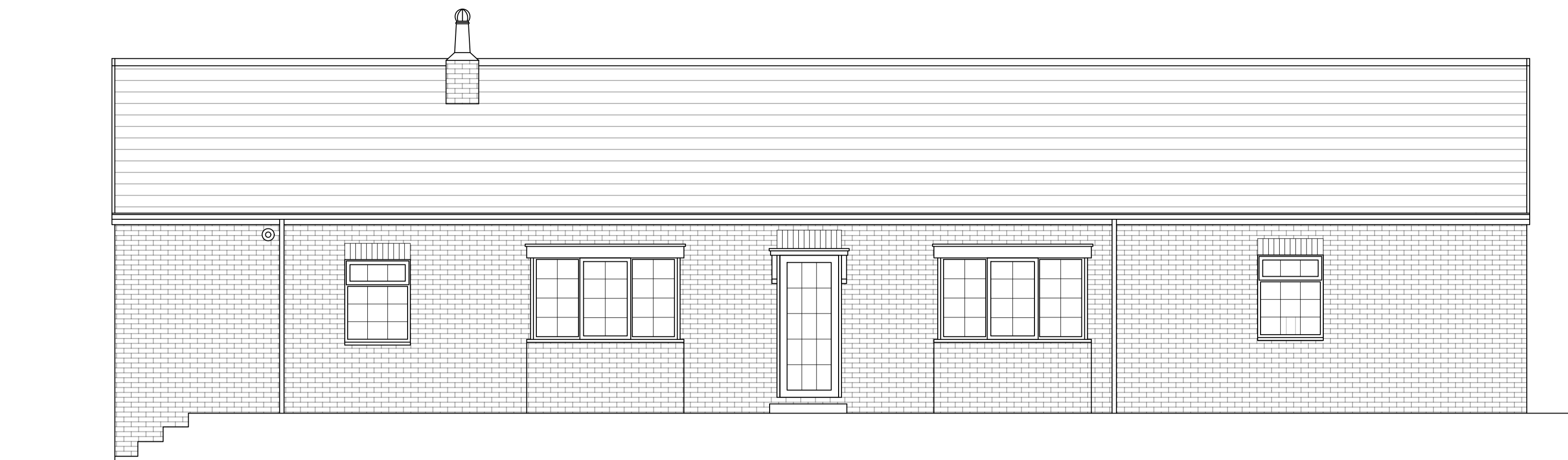
Existing North Elevation