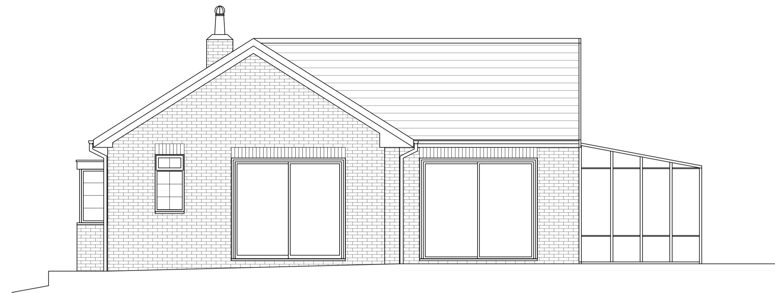
Existing West Elevation