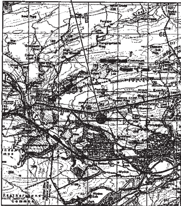
LOCATION PLAN Scale 1:50000

Based upon Ordnance Survey data with permission of the Controller of Her Majesty's Stationary Office. © Crown Copyright. All rights reserved. Spectra Telecom (UK) Ltd. Licence No. AL100034385