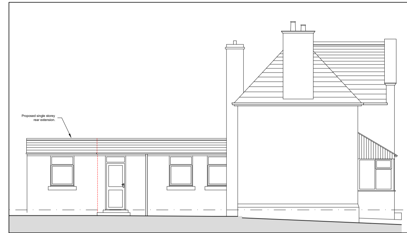
04 ELEVATION (WEST) Scale 1:100 @ A1