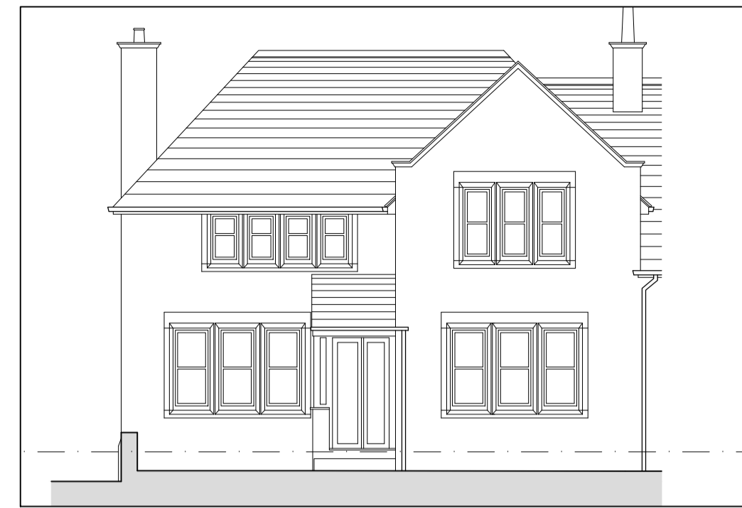
03 FRONT ELEVATION Scale 1:100 @ A1