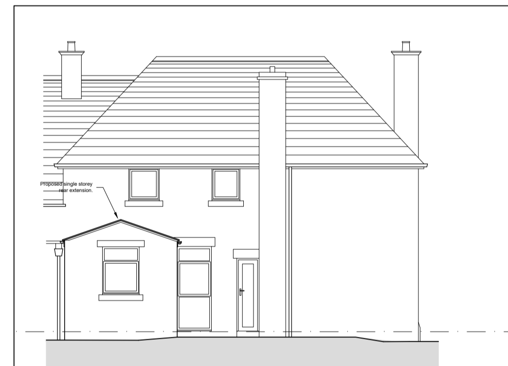
05 REAR ELEVATION Scale 1:100 @ A1