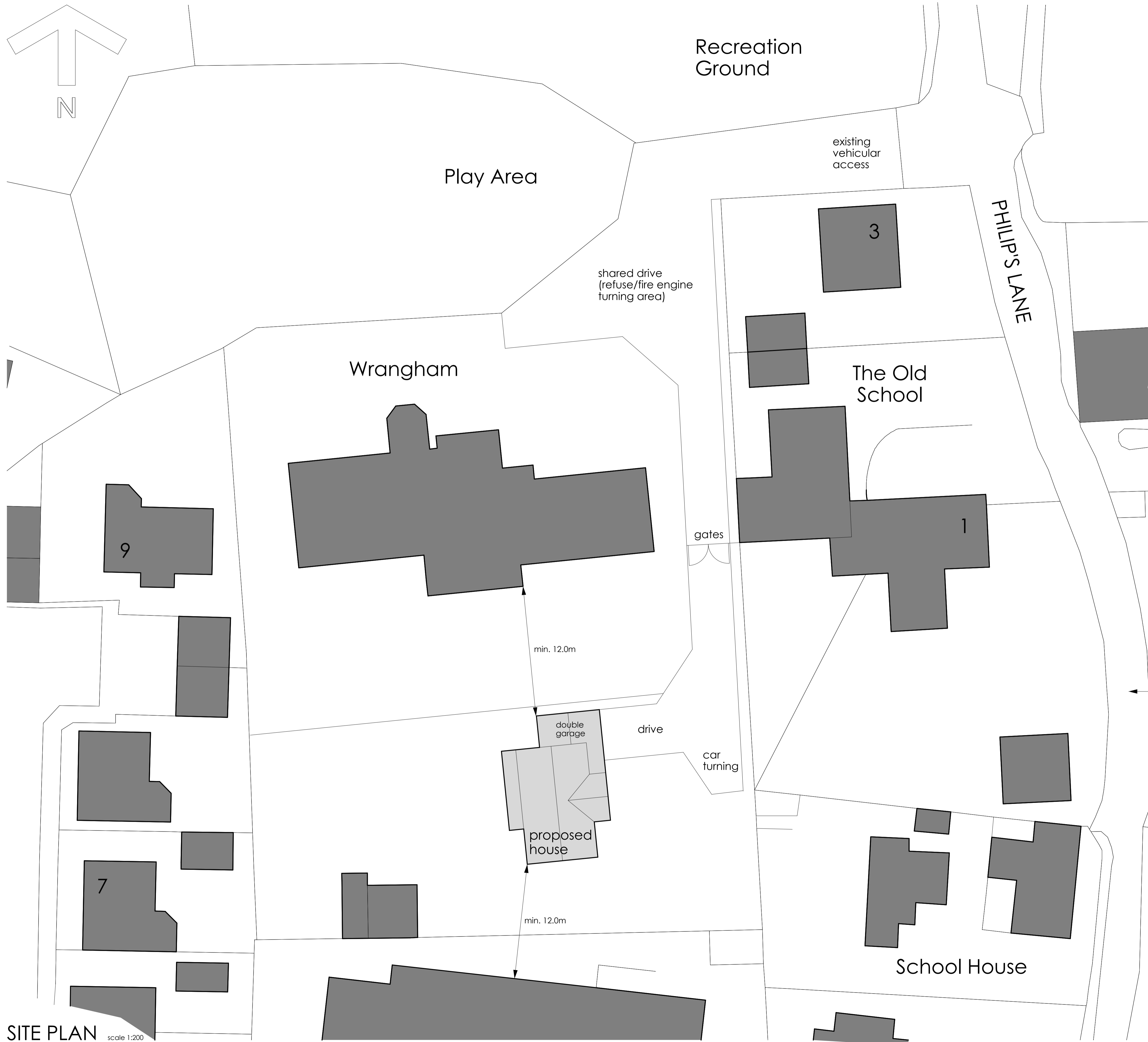
SITE PLAN scale 1:200