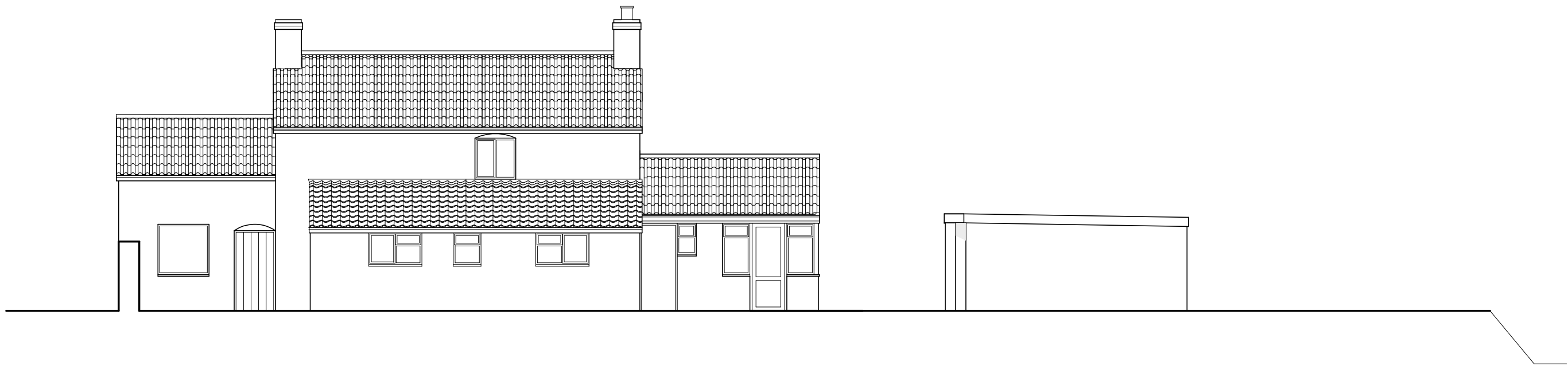
SIDE (NORTH WESTERN) ELEVATION

THIS DRAWING TO BE READ IN CONJUNCTION WITH THE FOLLOWING DRAWING NUMBERS