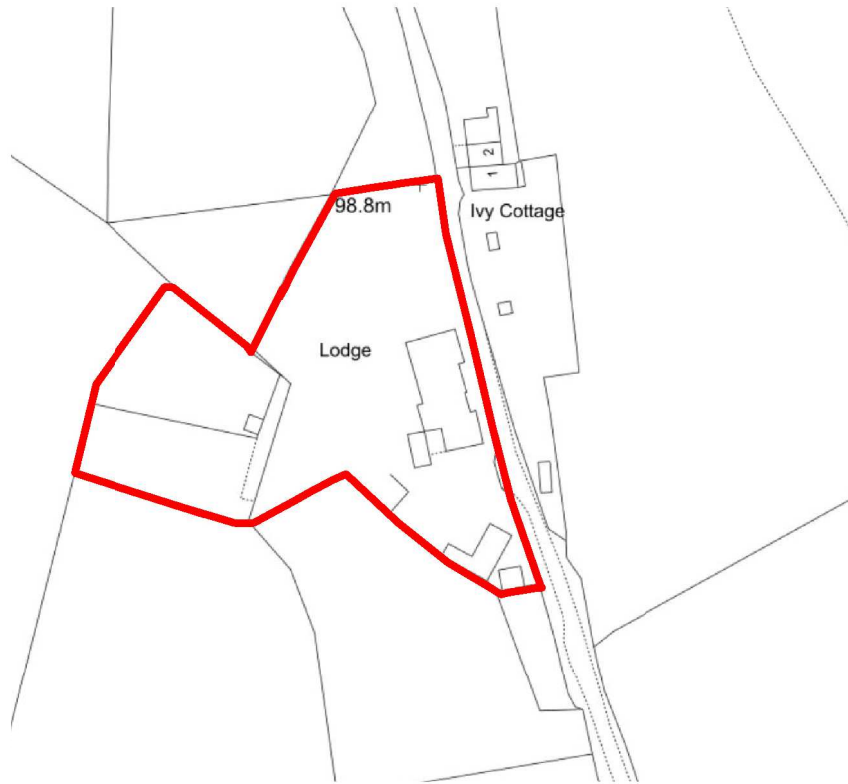
Site Plan 1 : 1250