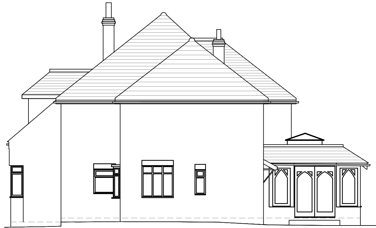
Existing Side Elevation 1:100