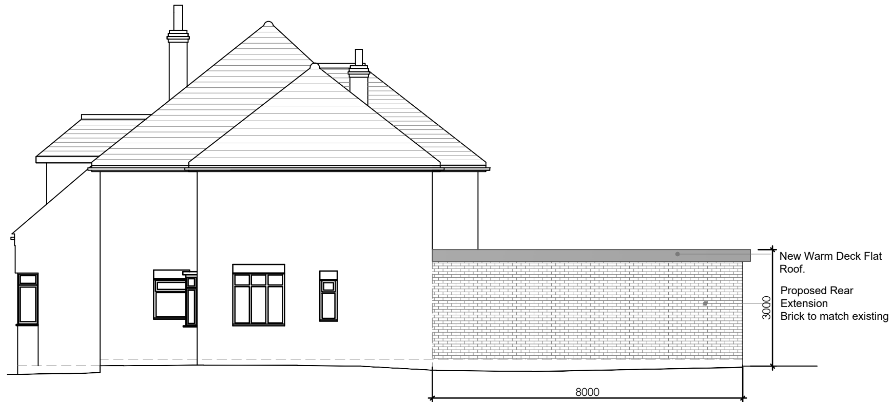
Proposed Side Elevation 1:100