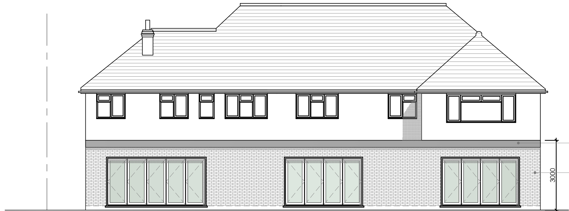
Proposed Rear Elevation 1:100

New Warm Deck Flat Roof. Proposed Rear Extension Brick to match existing