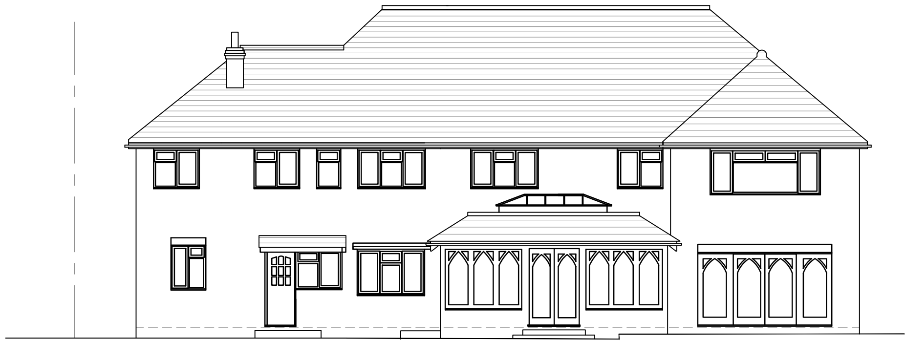
Existing Rear Elevation 1:100