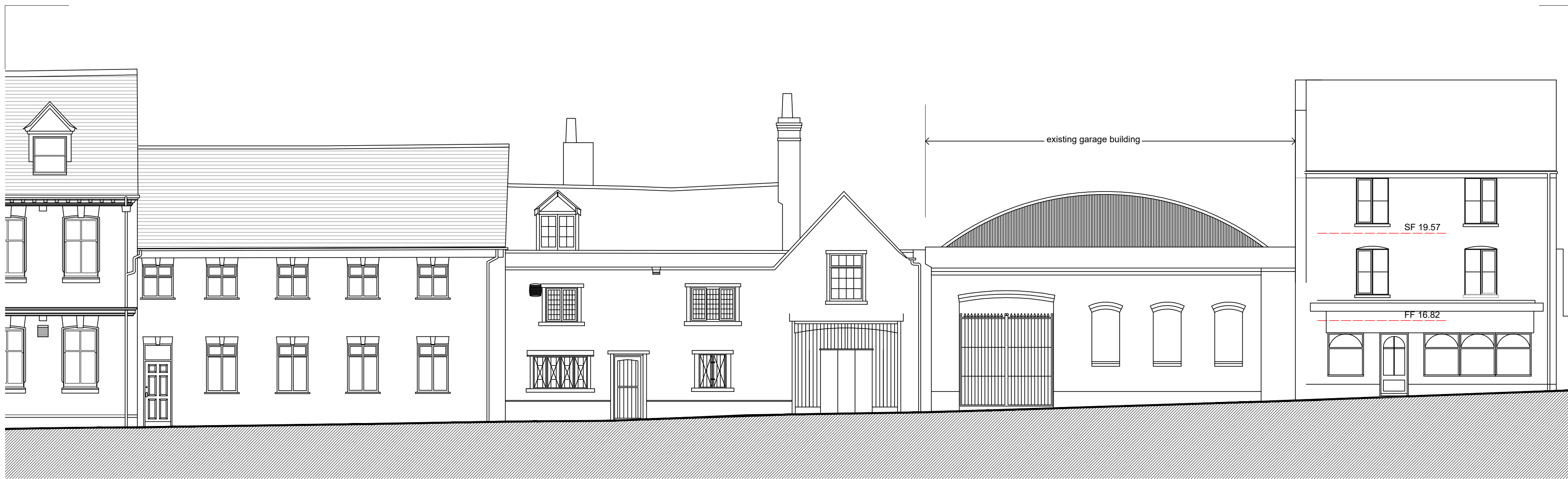
Quay Street (south/front elevation)