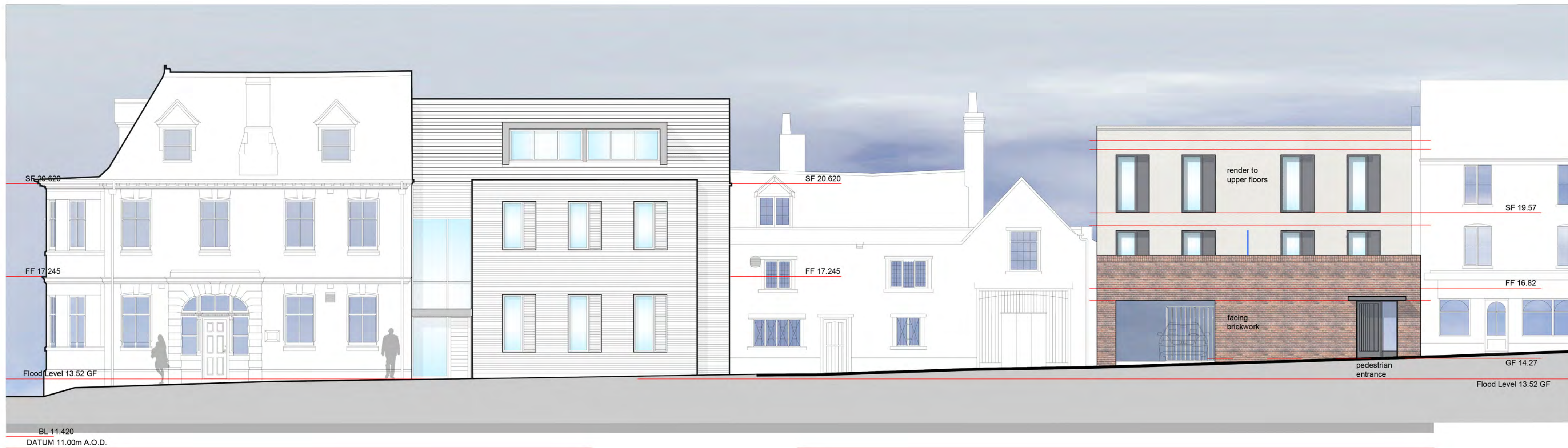
Quay Street (south/front elevation) as proposed