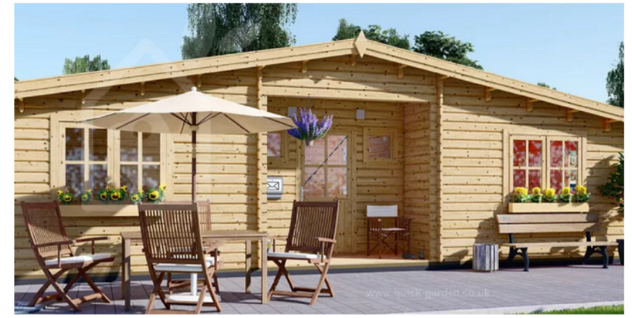
3D render of annex to be installed.