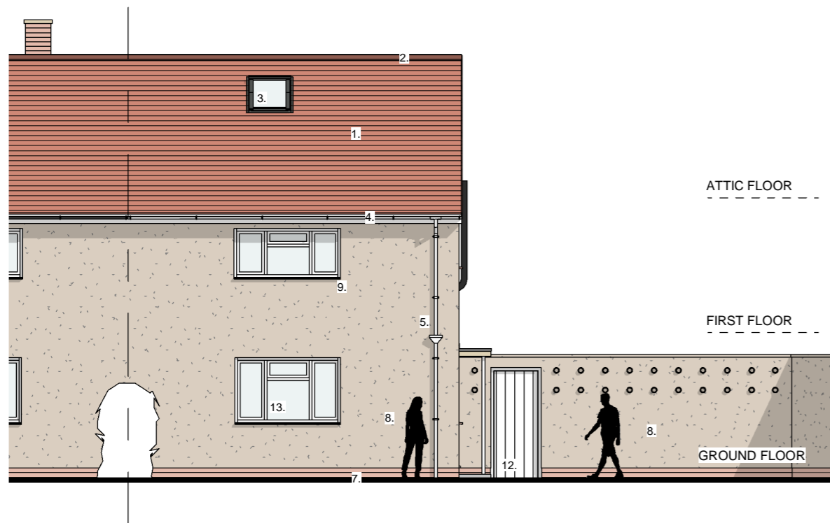
EXISTING SOUTH (FRONT) ELEVATION