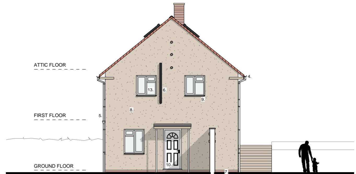
EXISTING EAST (SIDE) ELEVATION