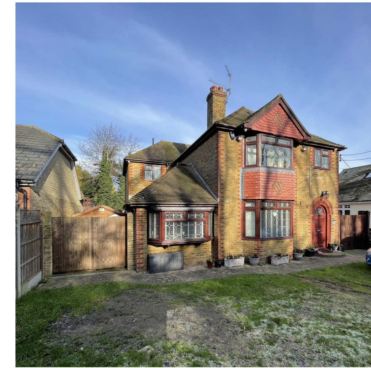
5 Front 2 1:6.61