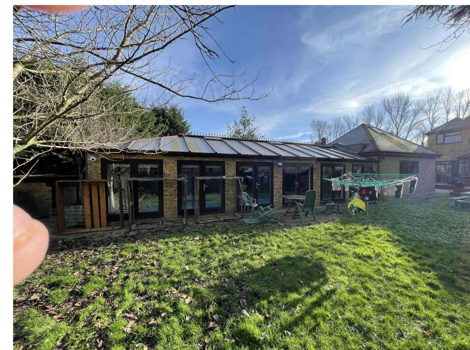
7 Pool 1 1:6.61