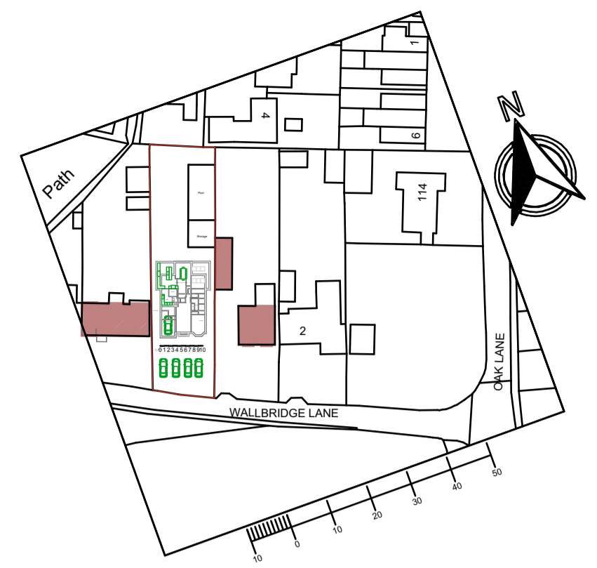
1 Location Plan Proposed 1:1250