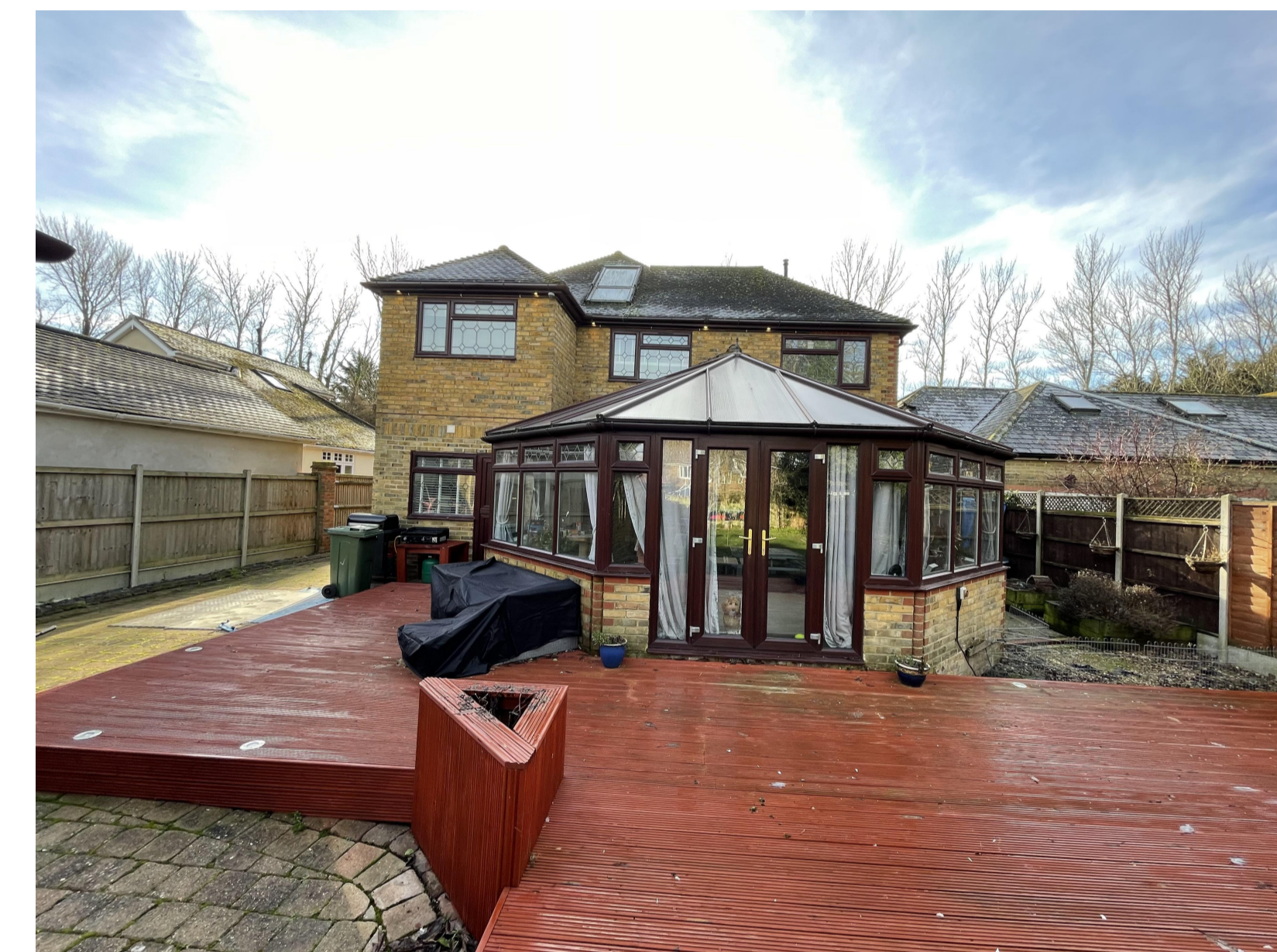
6 Rear 1 1:6.61