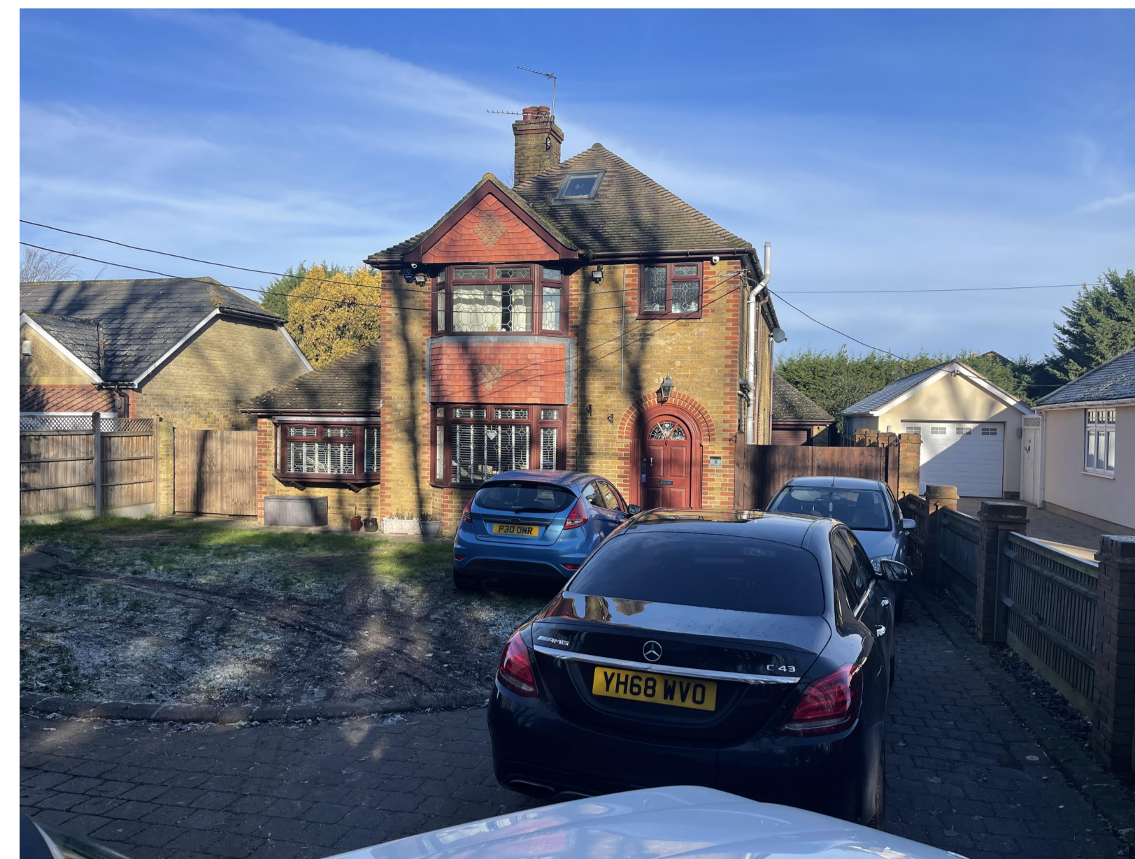
4 Front 1 1:6.61