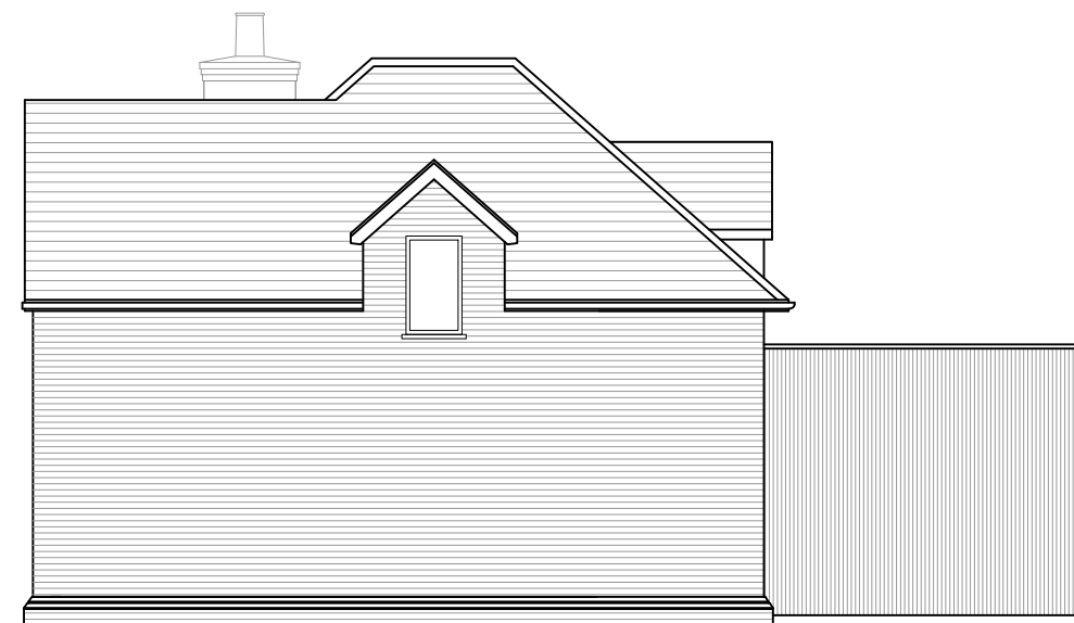
PROPOSED LEFT SOUTH SIDE ELEVATION