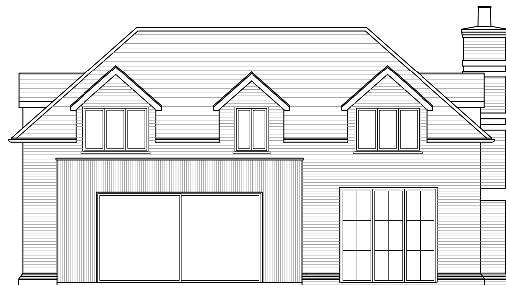
PROPOSED REAR WEST ELEVATION