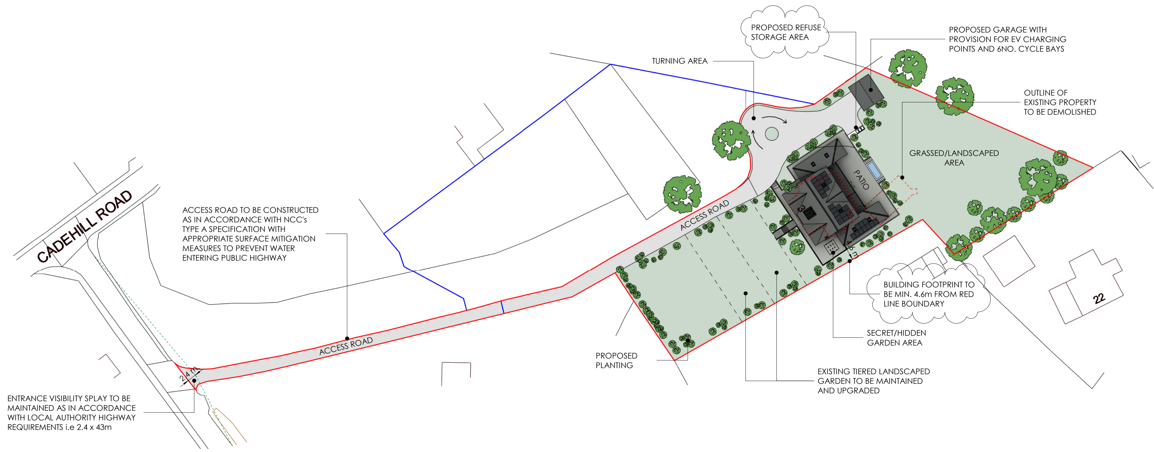
PROPOSED SITE/BLOCK PLAN 1:500