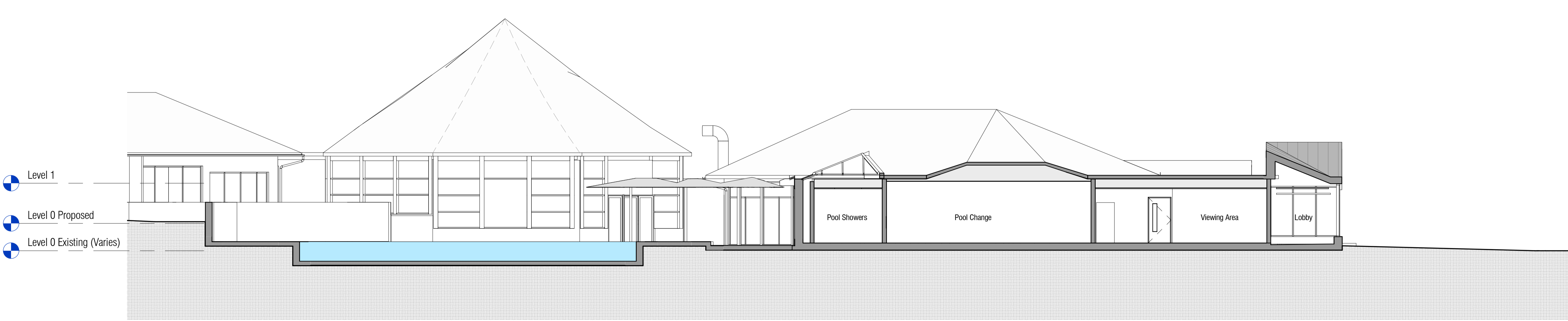
03 Proposed - Section 03 1:100