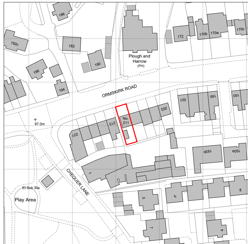
Site Location Plan [Scale = 1:1250]