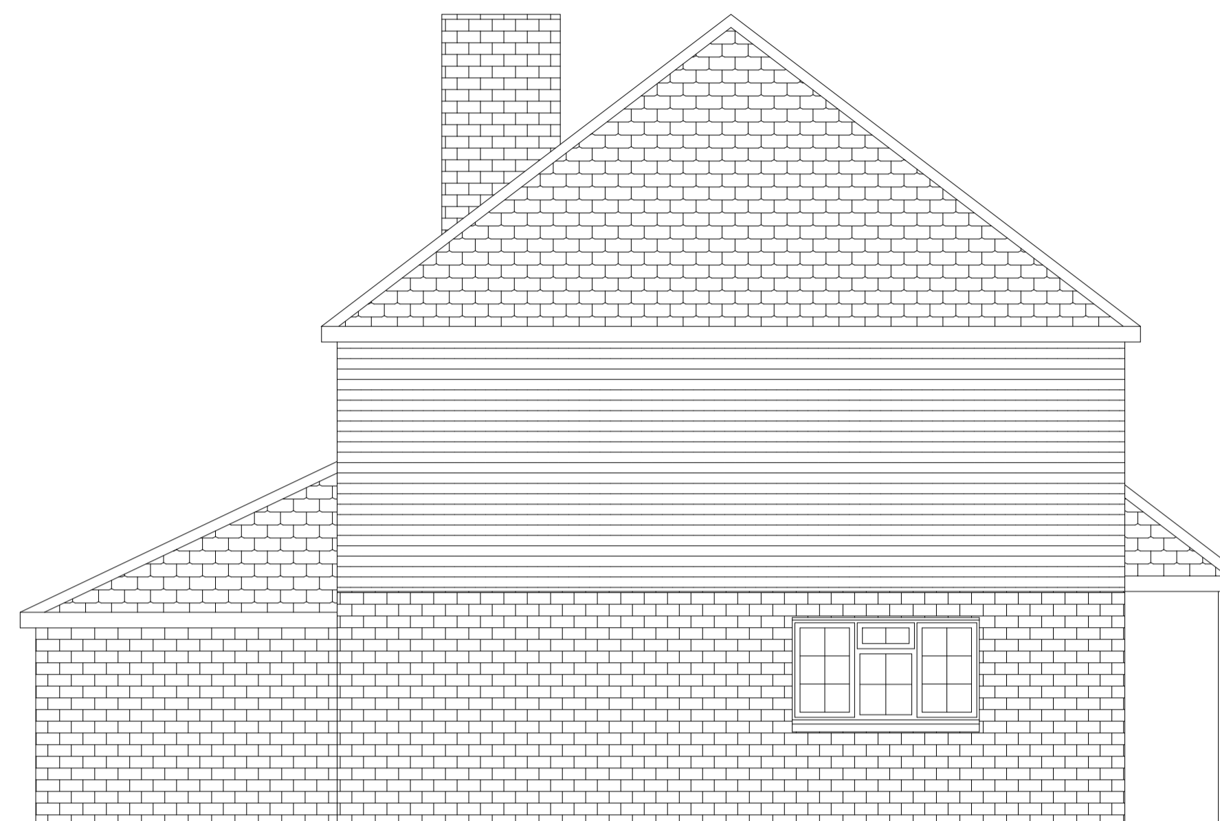
SIDE (SOUTH) ELEVATION