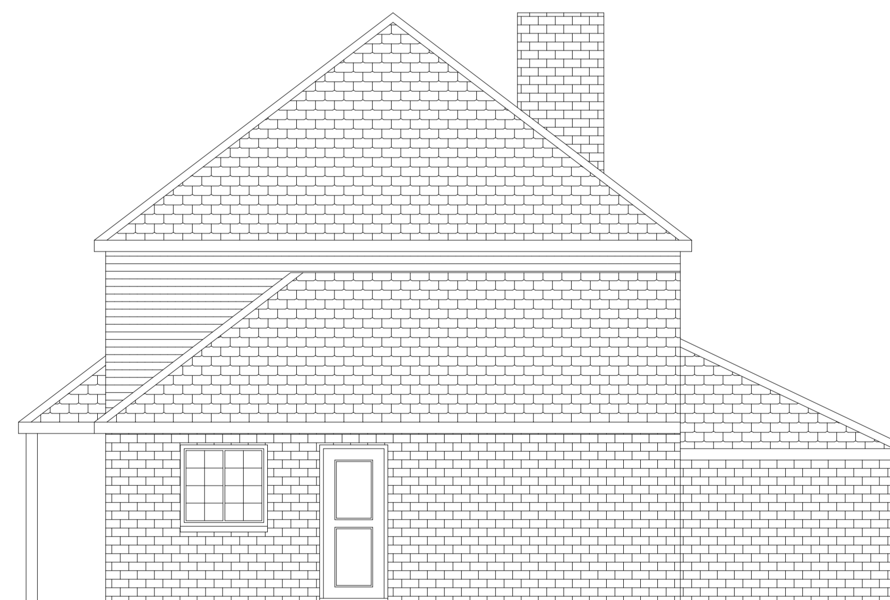
SIDE (NORTH) ELEVATION