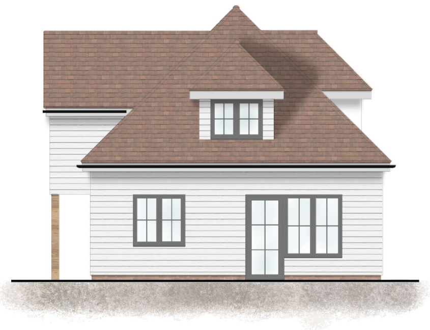
4. Proposed Side Elevation 1:100 @ A3