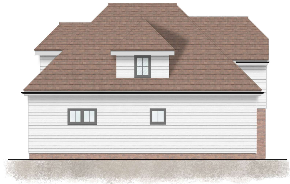
3. Proposed Rear Elevation 1:100 @ A3