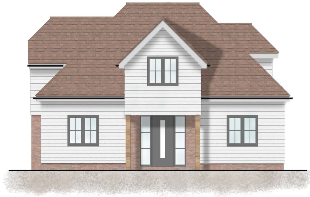
1. Proposed Front Elevation 1:100 @ A3