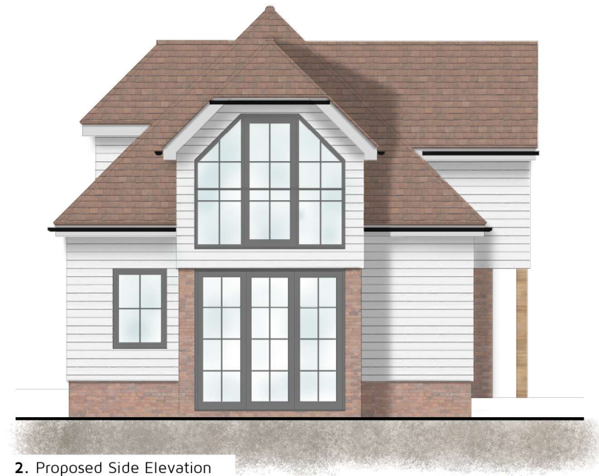
2. Proposed Side Elevation 1:100 @ A3