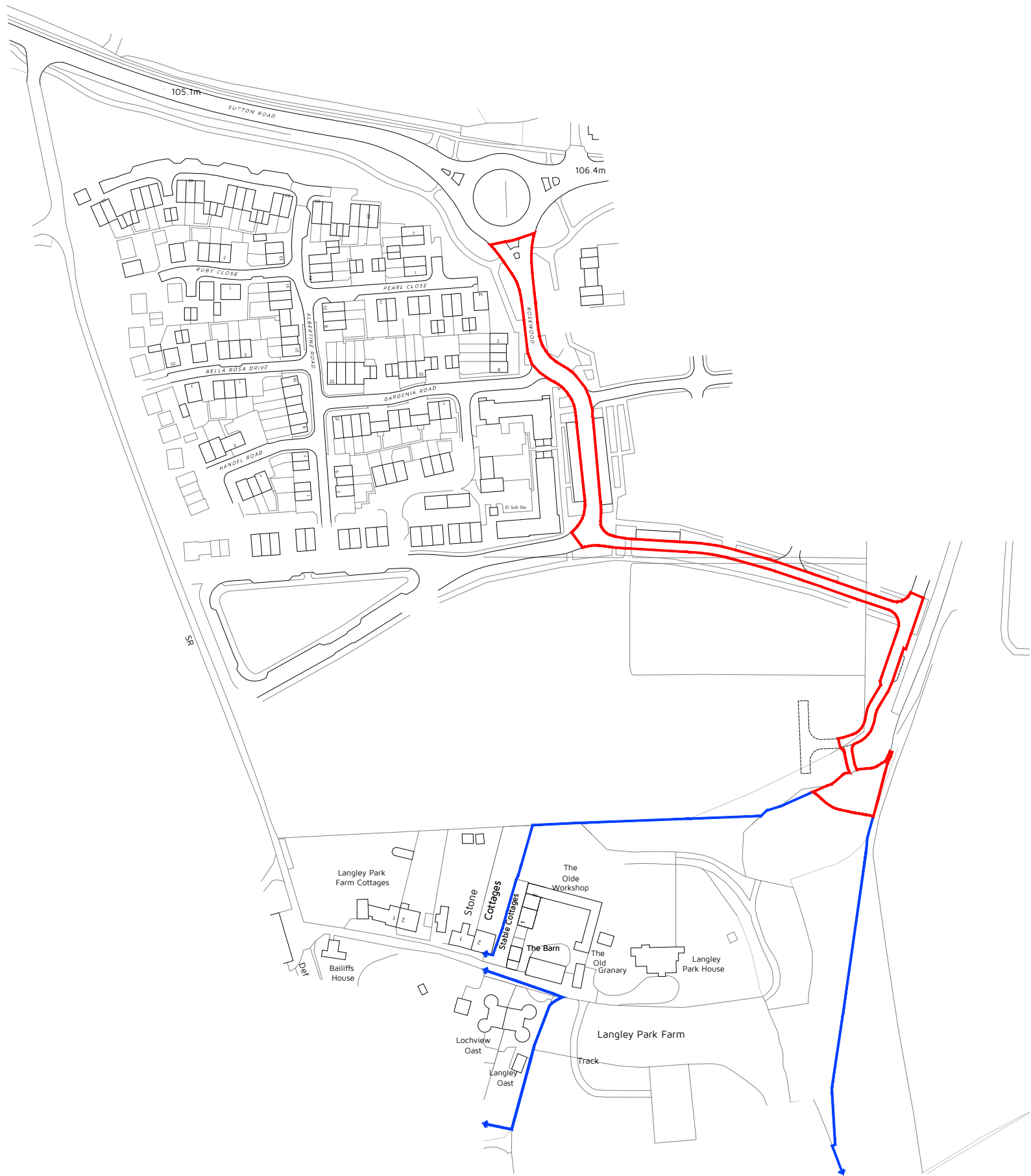
Site Location Plan 1:2500 @ A3