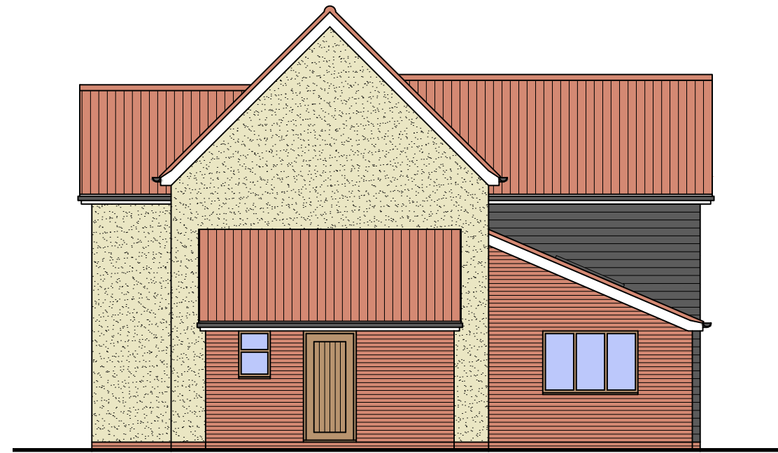
Side elevation to East