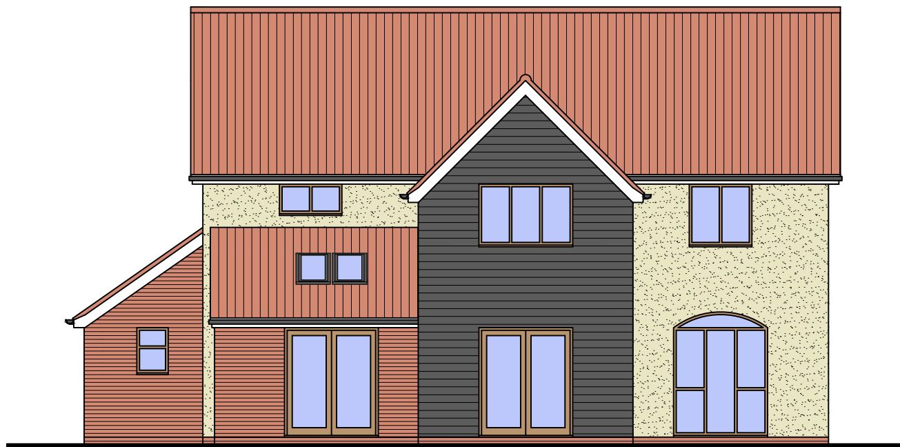
Rear elevation to North