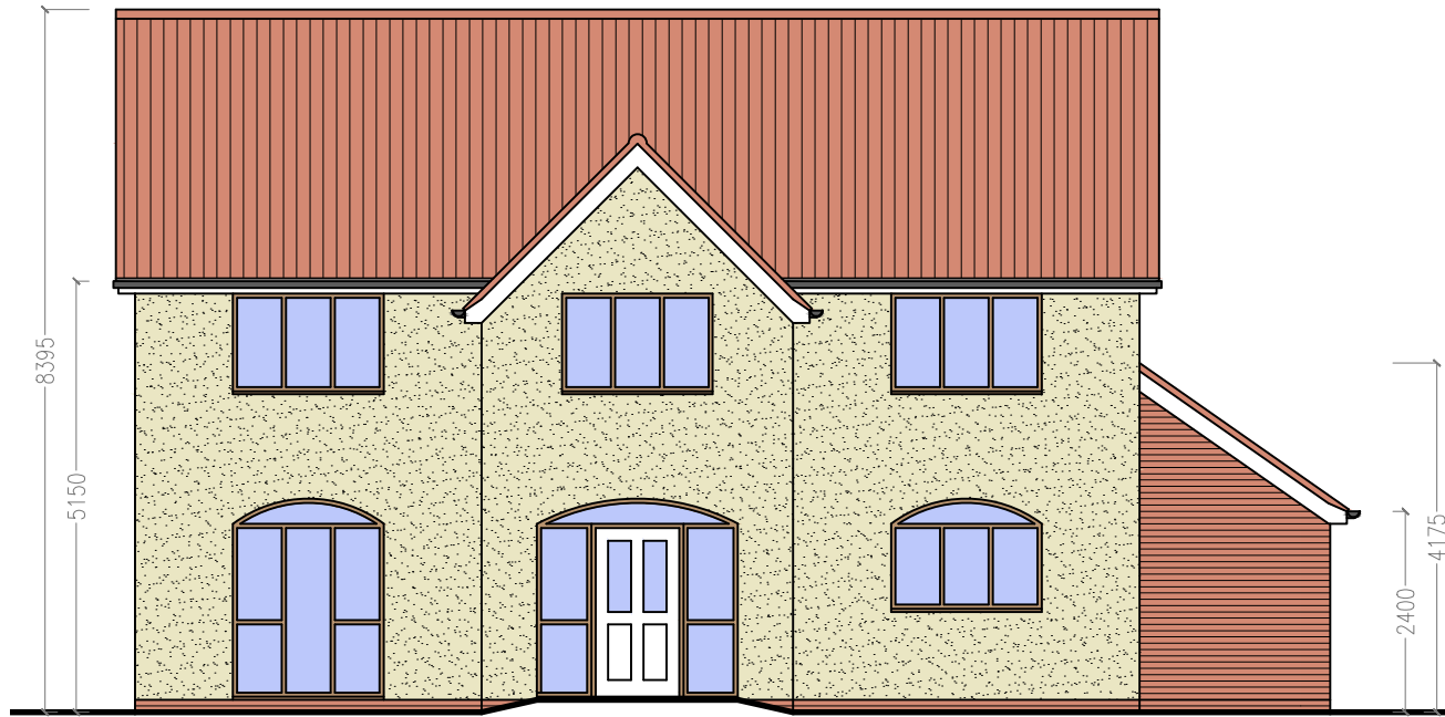
Front elevation to South