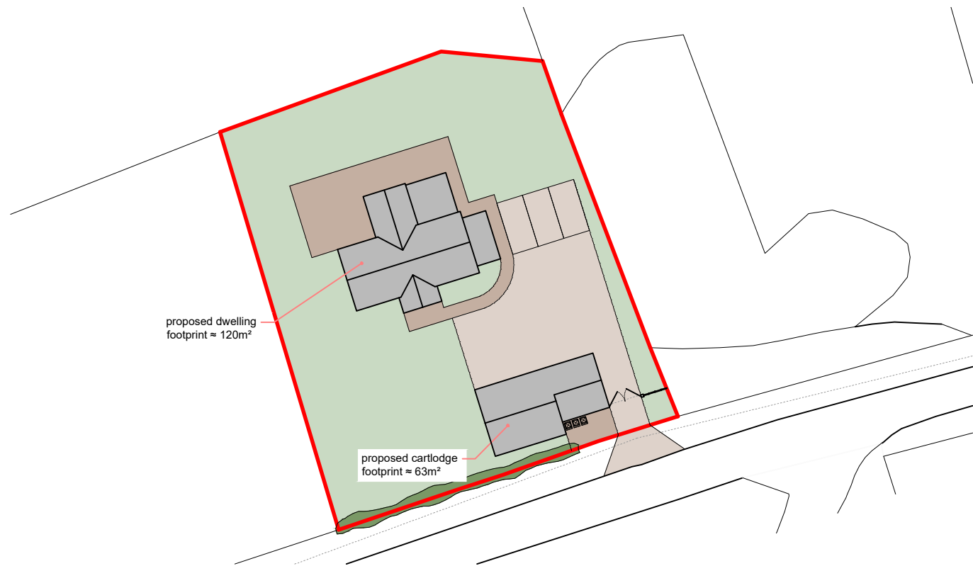
Block plan as proposed