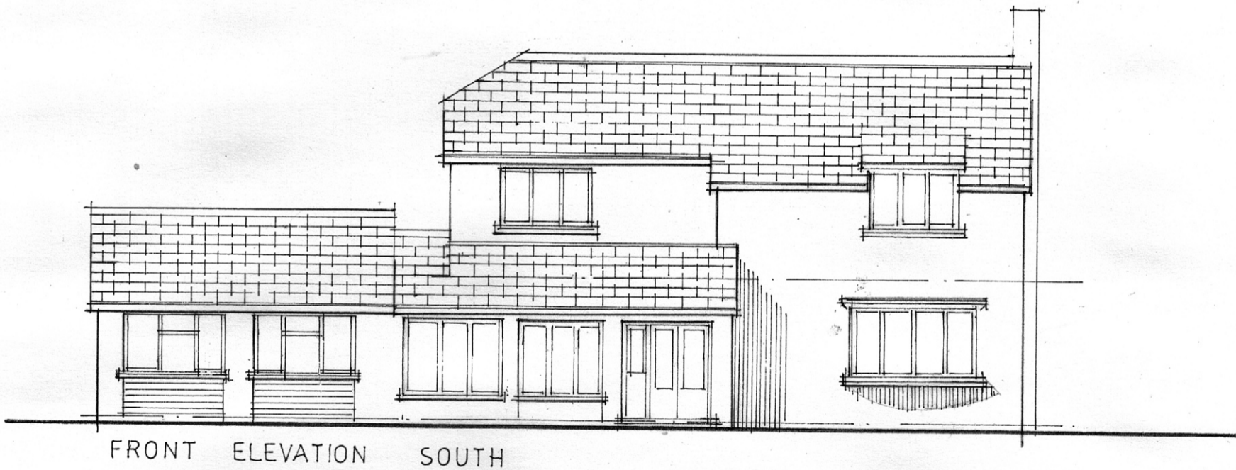
FRONT ELEVATION SOUTH