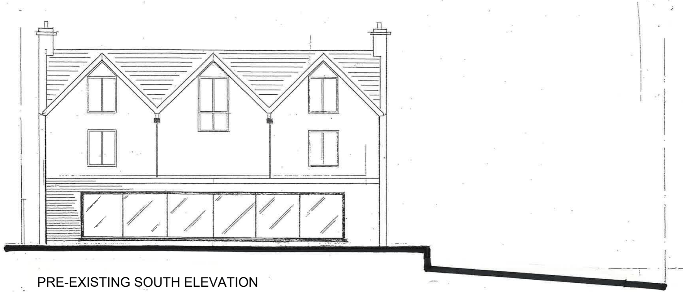
PRE-EXISTING SOUTH ELEVATION