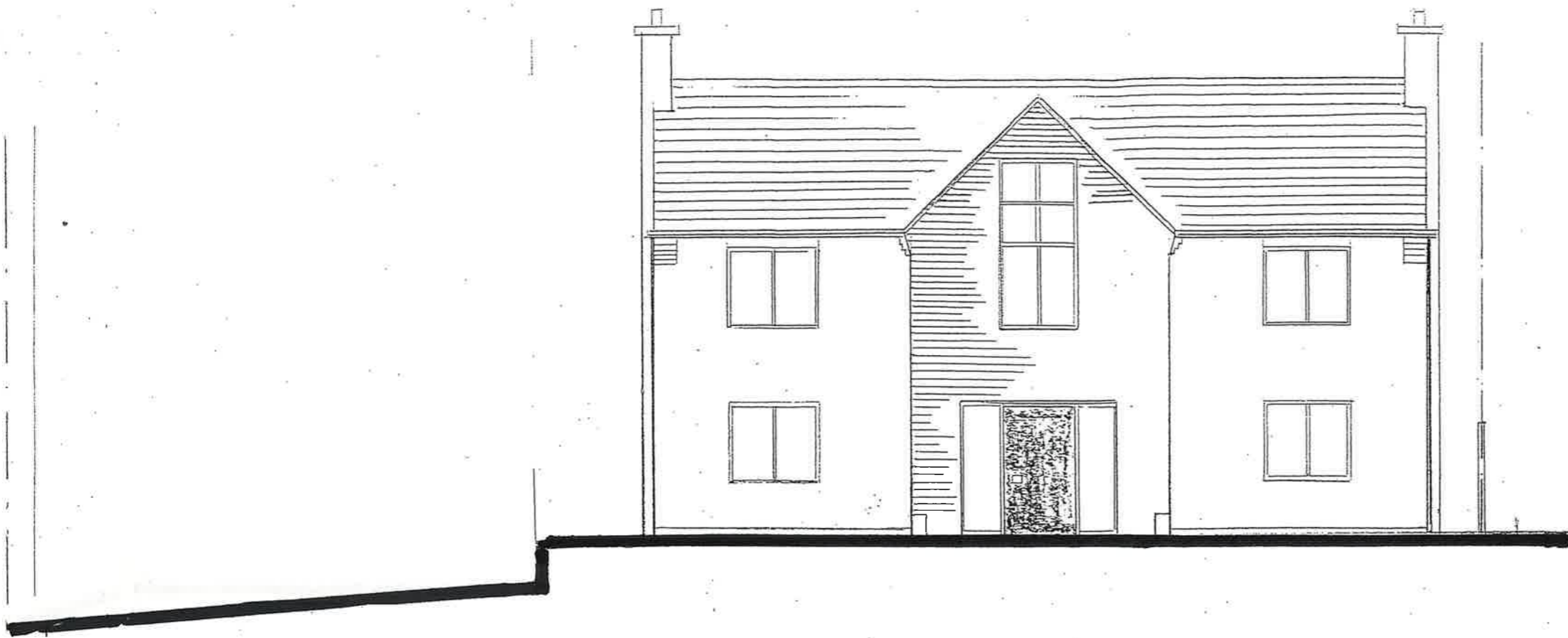
PRE-EXISTING NORTH ELEVATION