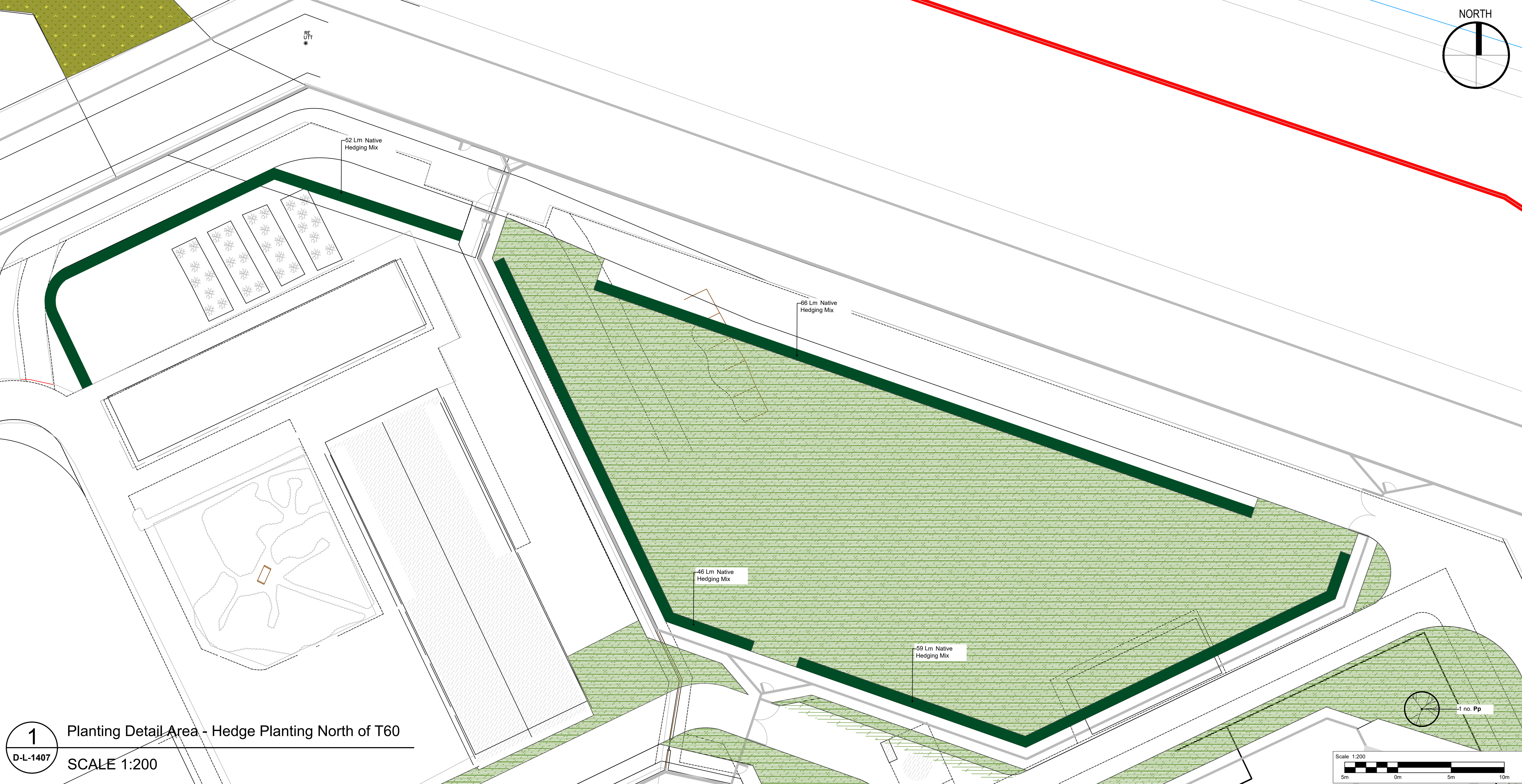
1 Planting Detail Area - Hedge Planting North of T60 D-L-1407 SCALE 1:200