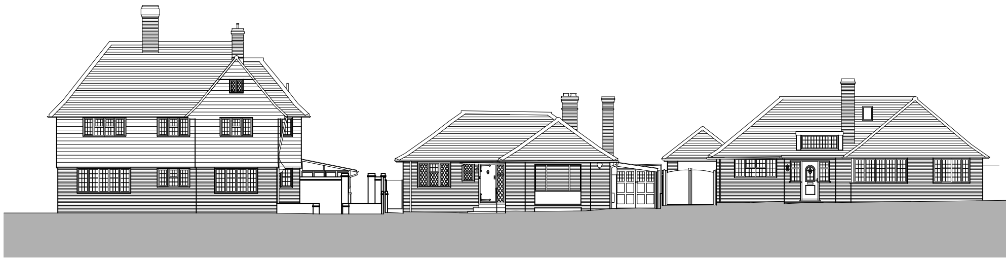
Existing Site Elevation