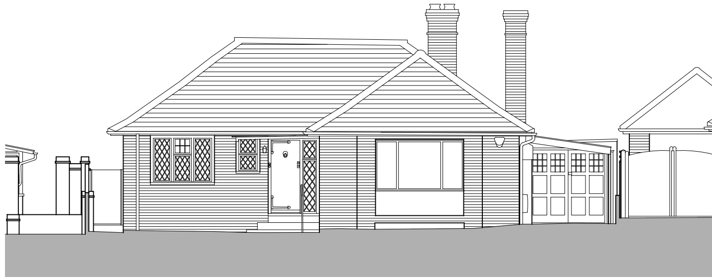
Front / South Elevation