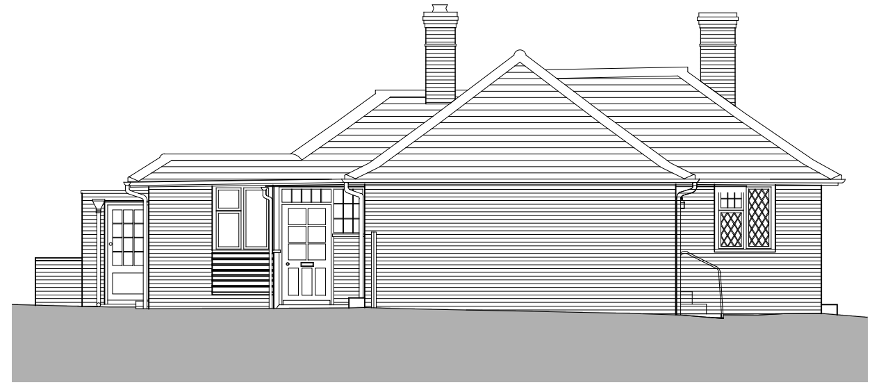
Side / West Elevation