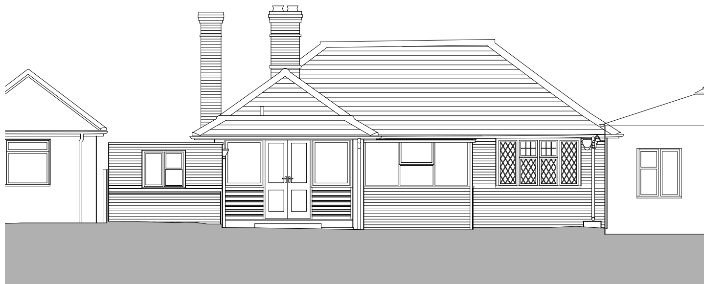
Rear / North Elevation