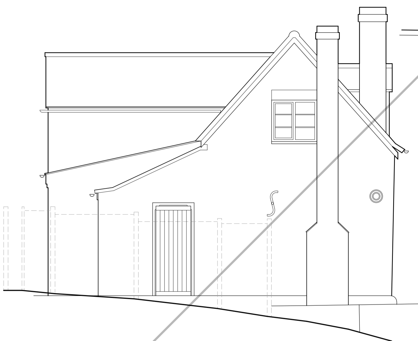
Side (west) Elevation