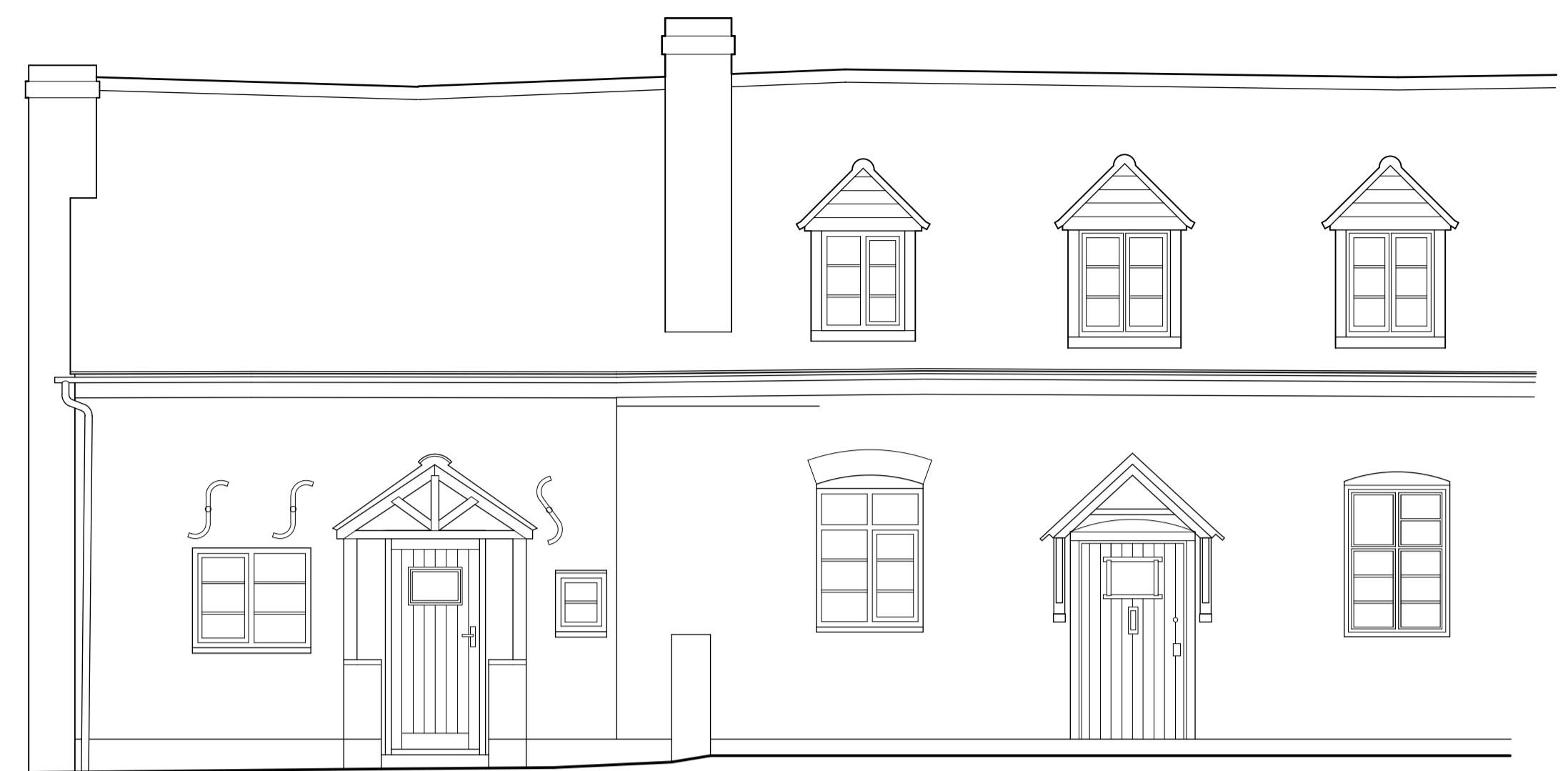
Front (south) Elevation