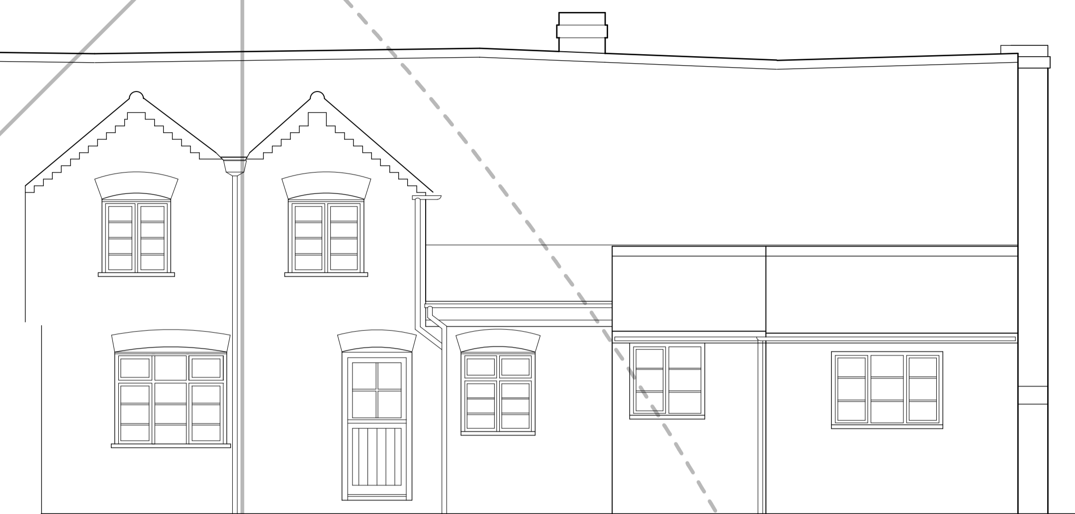
Rear (north) Elevation