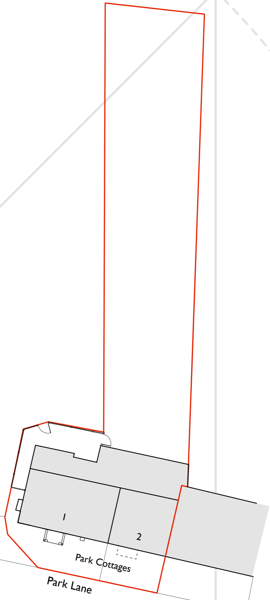
Site Plan 1:200